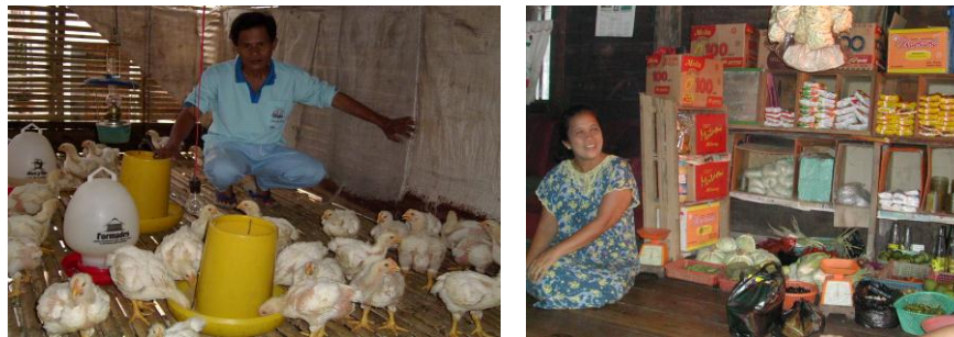
Fig. 2. Micro Financing Services

As a business entity in oil and gas, Medco Energi has program named as a Community Social Responsibility (CSR) for community development, through a Micro Financing Services. It is merely a sincere dedication to build a strong and sustainable partnership between Medco Energi and local communities to achieve a common goal of prosperous coexistence. Recently, the Micro Financing Service program has enrolled 238 small entrepreneurs including groceries, vegetable seller, carpenters, tailors, traditional bakers and barbers. One of the programs is to integrate them into 28 groups in order to empower the economic of each member of the group. The total funding to support this program is IDR238.4 million. This program is further supported by Local Government and Private Sector; creating synergies to provide maximum benefits in social and economic development, including relief the victims of natural disaster, improve education, health and public utilities.