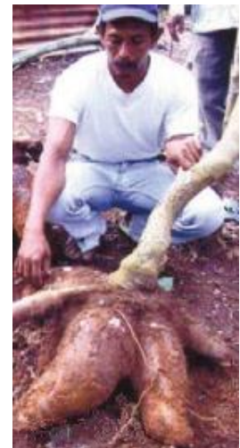
Photo on the right shows high-yielding cassava variety taken on January 6, 2004 in Lampung. One tree gives 27 kilogram non-edible cassava after 12 months grown. Therefore, harvest of 80-100 tons/ha can be expected [8]

On the left is the site location in Lampung province, southern end of Sumatera Island at Kotabumi. This ethanol project shall become the largest independent ethanol plant in Indonesia, see Table 2. When the market demand grows, Medco Energi will scale up this facility and produce full-grade ethanol (99.999%) [7].