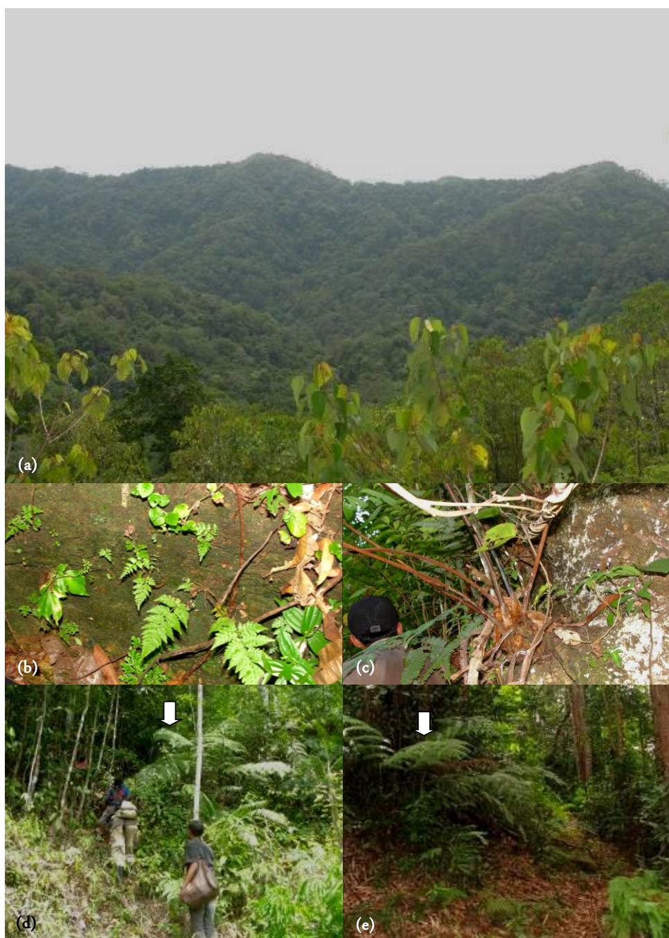
Figure 4. Habitat of C. barometz in Riau Province-Sumatra. Bukit Punggung Lading, hilly secondary forest and rubber plantation in Salasuang Country, Kampar Kiri Sub-district, Kampar District (a); C. barometz growing on sedimentary rock formation or rocky ground at the slope 80-90° on the humus soil or litter less than 2 cm depth (b and c), sporelings (b), mature sporophyte (c), mature sporophyte of C. barometz (d) growing among the dense of understorey in the rubber plantation in Bukit Punggung Lading I.; clump of C. barometz (e) growing among the dense of understorey in the dense secondary forest in Bukit Kuda Beban.

Bangkinang Subdistrict so low? The habitats of C. barometz in Bangkinang Subdistrict were areas of a rubber plantation about 5 – 8 years old, with a canopy coverage between 20 – 50%. The two localities are on the edge of the province's main road. Land use change seems to be