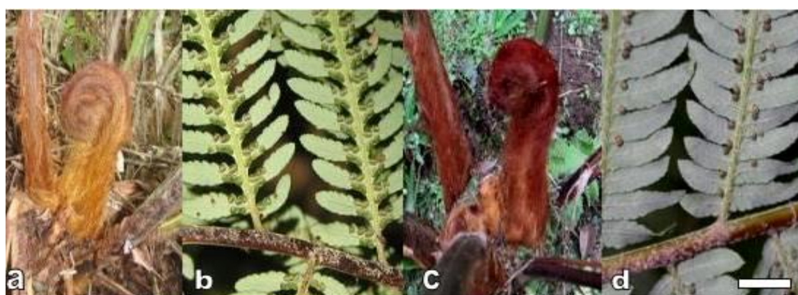
Figure 3. Morphological variant type of C. barometz in Sumatra. Variant-1 (a, b, and c); rhizome with stipe and crozier (a); part of pinna (b), Variant-3 (c and d); Rhizome with stipe and crozier (c); Part of pinna (d). Bar = 5 cm for a and c; 2.1 cm for b and d (Rugayah et al., 2009)

research, population size was determined by counting individual plants not clumps.