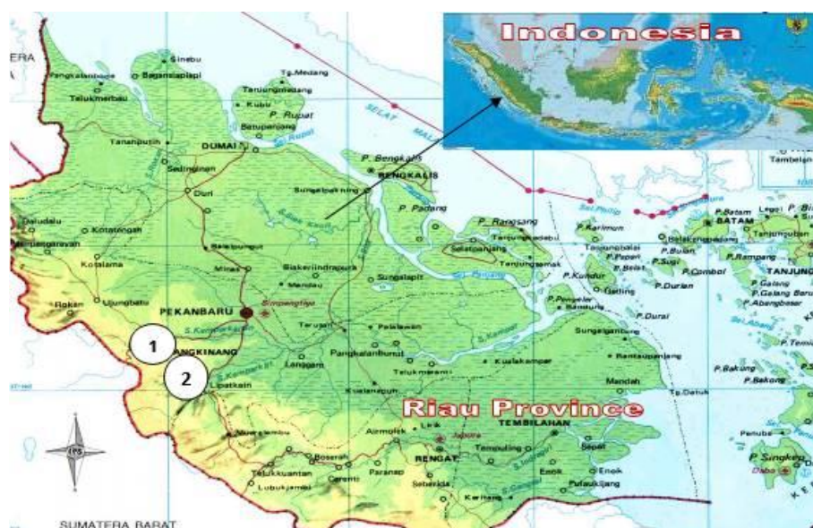
Figure 1. Distribution map of C. barometz in Riau Province, Sumatra. 1. Bangkinang Barat sub-district (two localities); 2. Kampar Kiri sub-district (six localities)