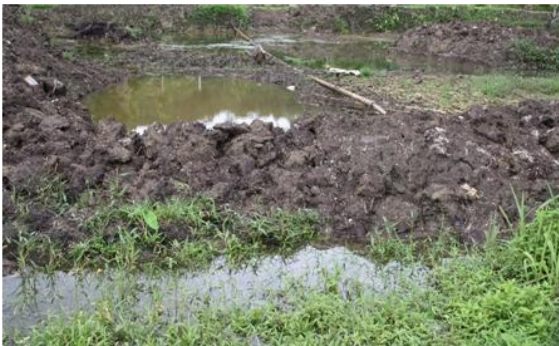
Fig. 3. Site selection for opening pond may cause destruction of coastal area.

The success of a commercial aquaculture business depends on providing the optimum environment for rapid growth. RAS offers the advantage over coastal pond aquaculture of being able to control the environment and water quality parameters to optimise fish health. Some parameters are crucial to RAS i.e., pH, temperature, suspended solids, and concentrations of nitrogenous compounds such as ammonia, nitrite, nitrate, dissolved oxygen (DO), carbon dioxide (CO 2 ) and alkalinity (Timmons, et al. , 2001). For instance, the optimum pH range for biofilter bacteria in RAS is around 7 to 8. The pH tends to decline as bacterial nitrification produces acids and consumes alkalinity and as CO 2 is generated by microorganisms and cultured animals. Water reacts with CO 2 to form carbonic acid that resulted to the decreasing of pH value, so, nitrifying bacteria will not be able to remove wastes of toxic nitrogen. Therefore, adding alkaline buffers is needed to maintain the optimum pH range. Moreover, continuously supplying adequate amounts of DO is essential as nitrifying bacteria become inefficient at DO concentration below 2 ppm. Generally, DO have to be maintained above 5 ppm for optimum cultured animals growth (Losordo, 1998).