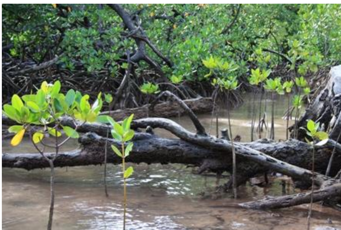
Fig. 1. Mangrove area that can be used for pond aquaculture.

the point of clear-felling for aquaculture, so, it cause an ecological changes in coastal areas and has consequences for people who living in coastal communities as they depend upon mangrove forests for a variety of benefits. For example, mangroves have provided many household necessities such as charcoal, construction materials, firewood, herbal plants for traditional medicines or ecological benefits such as acting as windbreaks, controlling shoreline sedimentation and providing a habitat for marine animals. Therefore, the destruction of coastal mangrove or marsh will lead to a general decline in wild stocks.