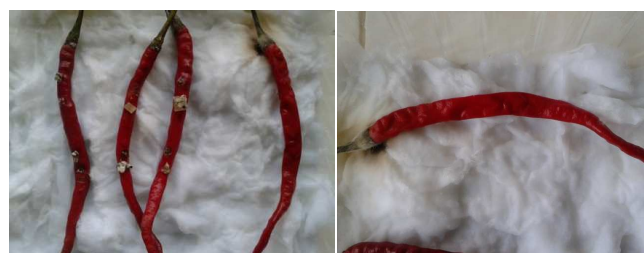
Fig. 3. Preliminary test for the ability of liquid smoke as biofungicides against C. Capsici at red pepper. (Liquid smoke concentration of 5%).

The treatment of preliminary test on c. capsici was conducted in liquid smoke concentration of 1-50%.