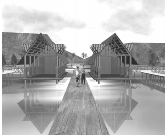
Fig. 3. The Plan for wharf

Jet Ski and motor boat is already provided in Ujungnegoro and these facilities could be rent by tourists to enjoy the authenticity and romantic flavor of its waterfront.