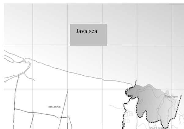
Fig. 1. Batang Administrative Boundary

The topography itself is moderately undulating and rolling to a very steep slope. It has an elevation range of 0 meter to 14 meters above mean sea level. A west side tourism area shows steep rugged hills rising from the coastline, culminating in a broad peneplain with rolling hills extending towards and past the central portion of the area. This gradually decreases in elevation in slight and moderate slopes until the southern coastline. It is therefore, Ujungnegoro is divided into two zones: Upper and lower zones. The upper zone is religious tourism spot. There is a Syeh Maulana Mahgribi grave located on the hilltop. This place is visited by tourists only in a specific occasion. While, the lower zone covers natural tourism spot which offers the pristine beauty of the beach and the area along the sea side.