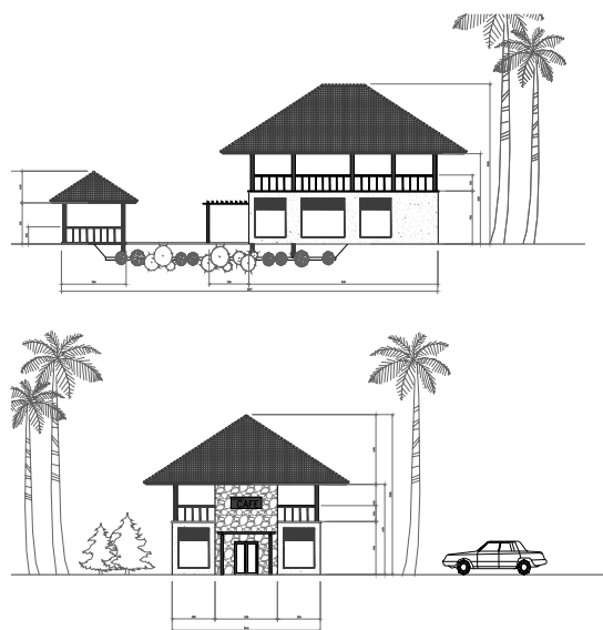
Fig. 5. The Plan for Floating Restaurant