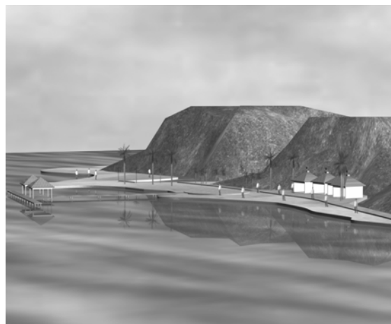
Fig.4 The Perspective design for wharf