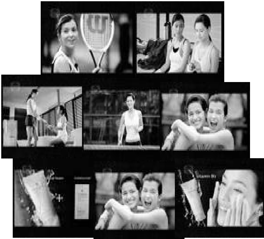
Figure 3: Ponds tennis version on television advertisement

“Her playing better ..., her face looked whiter ...” This sentence denotes that there are two models who have different skin color, they are, brown-skinned and white-skinned women. In this context, ads maker is the seller who has particular interest to sell the product, and the the television audiences are as targeted consumers of Ponds products. In fact, the targeted consumers are white women, because actually (the sentence... her face looks whiter ...), aimed to women who already have a white pigment. Furthermore, the ideational meaning should be able to answer questions about discourse. In the context of tennis version, the ads describes the product called Ponds Moisturizer and Facial Foam , which contains vitamin B3. So, there are two products to sell. The first kind of moisturizer is to using after shower), the second one is a cleanser or soap. This ads supposed to sell both