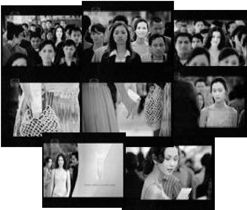
Figure 4: “walking in the crowd version” television advertisement of Ponds

This new product is trying to lure viewers to use Ponds Body Lotion , so “whiteness” will spread from face to toe. If the whiteness spreads to all the women body from face to toe so the women are being “beautiful”. Second, the advertisement talks about the comparison between white and stripes skin. The manufacturer indicates that white women get more “attention” from the men (the ads shows that most of men around them just look at the white skin woman but not at black skin woman). Therefore, it can be stated that the benefits of the product in treating female beauty is really highlighted by advertisers with the assumption that women should take care of their beauty in order to attract the opposite sex.