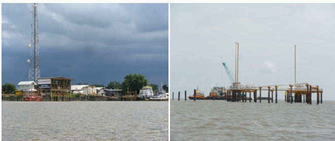
Figure 2. Oil and gas industry in Mahakam Delta

Besides of fisheries, oil and gas activity also exists in Mahakam Delta (Figure 2). Oil and gas industry is the most reliable sector that contributes to the economic development of Kutai Kartanegara. Mahakam Delta is regarded as important area due to the largest producer of oil and gas mining. Thus, it has important impact for the development of this area and its surrounding.