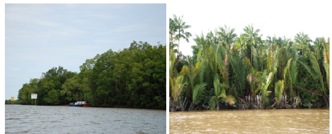
Fig 3. Mangrove ecosystem in Mahakam Delta

Mangrove forest is more frequently flooded by water compared to swamp forest and dry land forest. Mangrove forest only consists of trees not higher than 25 m, others vegetation are rarely found except a new seedling growth of the same variety. This is due to regular tidal flooding upon mangrove forest. Bourgeois et al. (2002) stated that Mahakam Delta is formed through sedimentation process of Mahakam River, the longest river in East Kalimantan. It is divided into four vegetation zones, namely: perennial tree of low land tropical forest, palm tree and mixed lowland forest, Nypa mangrove forest and swamp forest. Together, Nypa swamp forest and mangrove forest is jointly termed as mangrove forest as their spreading depends on the presence of sea water. It covers about 60% area of delta. The ability of strong root system of mangrove forest to prevent the coastal area from waves and coastal abrasion makes this area as buffer zone. In Kalimantan, eight mangrove families have been recorded i.e. rhizophoraceae , Avicenniaceae , Sonneratiaceae , Combretaceae , Meliaceae , Myrsinaceae , Euphorbiaceae , and Palmae . The predominant genus in Mahakam Delta is rhizophora , bruguiera , avicennia , sonneratia , lumnitzera , xylocarpus , aegicera , exocoeria , and nypa (Mackinnon et al. , 2000).