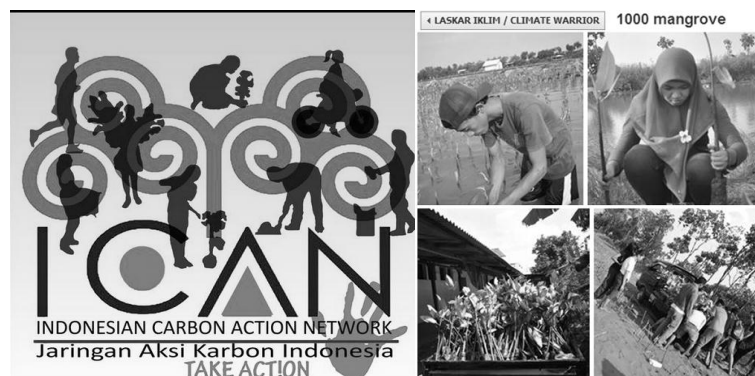
Figure 5. The Indonesian Carbon Action Network (ICAN) and its members actively involved in replanting 1000 mangroves along northern coastal areas of Java Island (JAKI, 2012).

Although Indonesia witnesses many NGOs that are involved actively in sustainable development programs, this paper focuses only on the ICAN (JAKI) activities, because: (1) this NGO's founder and principal members are also the ISLA members, and (2) this NGO has been focusing its activities on handling climate change mitigation and adaptation. See Figure 5 to view the activities and icon of this NGO of the " Climate Warriors ", a title as the members claim themselves (JAKI, 2012).