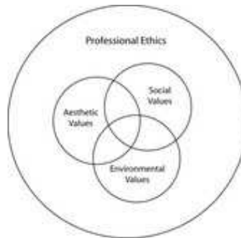
Figure 2. Professional Ethics in Landscape Architecture , (adopted from Thompson (2000a))

In reviewing the LA practitioners roles and capacities based on the IFLA's principles, this study adopts the trivalent value systems of LA practice to accomplish their projects. Among the ethics elements suggested by Thompson (2002) this paper will focus on the Ecological Values, whereas the other systems are also incorporated in order to pursue the study on climate change adaptation and mitigation. See the Figure2. Professional Ethics of Landscape Architecture .