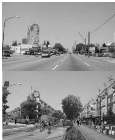
Figure 1. Visualizing Climate Change: A Guide to Visual Communication of Climate Change and Developing Local Solutions (Sheppard, 2012)

During the last two decades we have seen emerging literature on architectural, planning and landscape architecture in related topics of sustainable development as well as global warming and climate change adaptation. As computer-aided-design (CAD) penetrates the design and planning disciplines, the built environment professions have a great advantage in using it in their practice. The advanced tool of landscape visualization turns out to be useful in communicating the improved landscape condition to the general public. The images of future low-carbon-conditions of certain sites, which are more easily presented to people with the landscape visualisation approach (see Fig.1), are also very useful in educating people and enhancing their awareness and subsequent motivation to participate in the climate change adaptation movement (Sheppard, 2005, Sheppard, 2012).