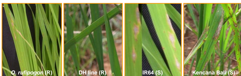
Figure 2. Blast performance on for rice genotypes in a screenhouse. R = resistant, S = susceptible.

DH = double haploid. Scoring of blast resistance was based on IRR St Ev.S (IRRI 1996).