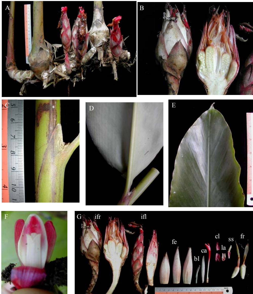
Figure 5. Hornstedtia scottiana . A. Radical inflorescence. B. Inflorescence, close-up with dissection. C. Ligule and base of leaf blade. D. Apex of leaf blade. E. Base of leaf blade. F. Flower, close-up. G. Flowers, close-up: ifr = infructescence with dissection, ifl = inflorescence with dissection, fe = fertile bract, bl = bracteole, ca = calyx, cl = corolla lobe, la = labellum, ov = ovary, ss = stamen and stigma, fr = fruit. M. Ardiyani 219 . Photographs by M. Ardiyani.