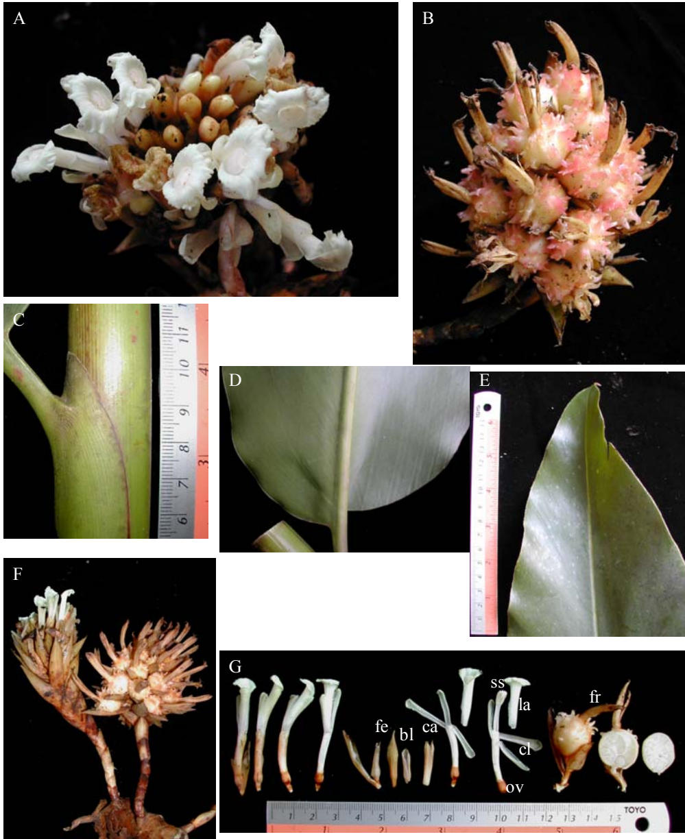
Figure 6. Etlingera rosea . A. Inflorescence, close-up. B. Infructescence, close-up. C. Ligule. D. Base of leaf blade. E. Apex of leaf blade. F. Inflorescence and infructescence. G. Flowers, close-up: fe = fertile bract, bl = bracteole, ca = calyx, cl = corolla lobe, la = labellum, ov = ovary, ss = stamen and stigma, fr = fruit. M. Ardiyani 218 .