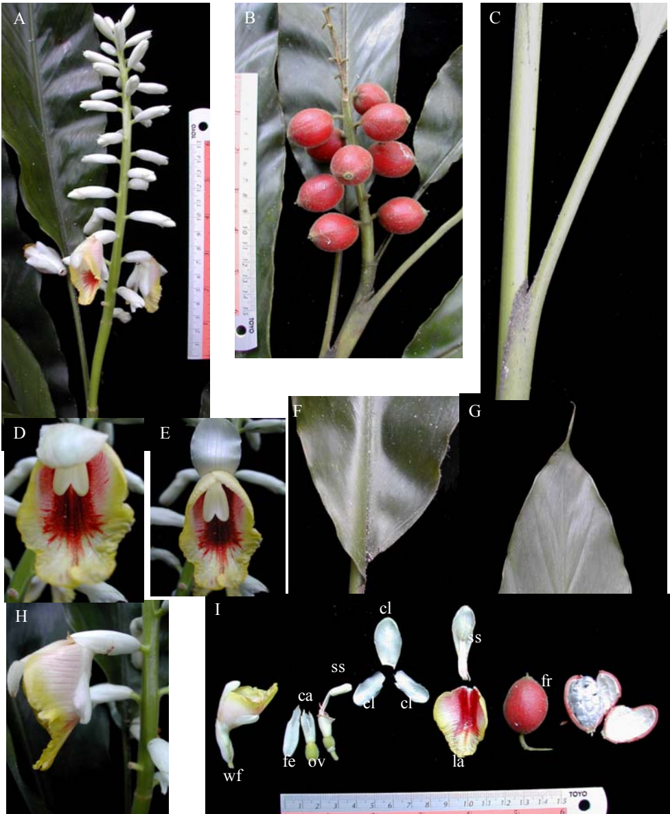
Figure 3. Alpinia novae-pommeraniae . A. Inflorescence. B. Infructescence. C. Ligule and petiole. D & E. Flowers, close-up. F. Base of leaf blade. G. Apex of leaf blade. H. Flower, side view. I. Flowers: wf = whole flower, fe = fertile bract, ca = calyx, cl = corolla lobe, la = labellum, ov = ovary, ss = stamen and stigma, fr = fruit. M. Ardiyani 231 .