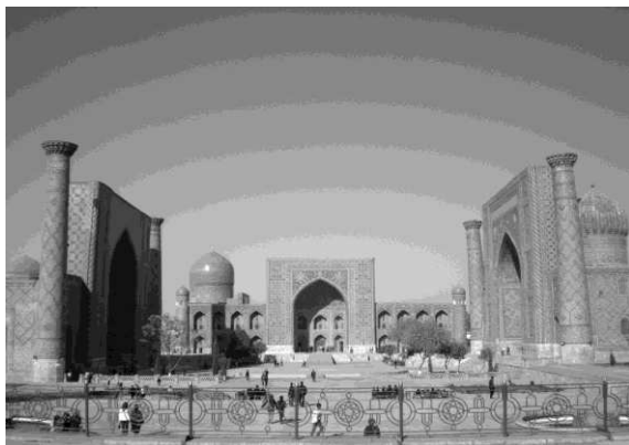
Figure 6. The Registan Square consisting of three Madrasahs (Schools) in Samarkand, Uzbekistan