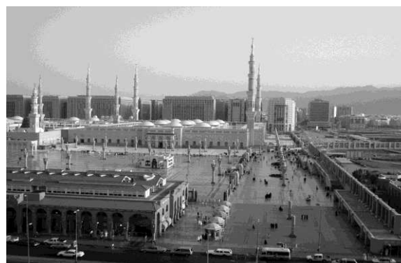
Figure 2. The Prophet's mosque today and some of its surrounding areas, seen from a nearby building. The size of today's Prophet's mosque, with all of its adjoining facilities and infrastructure, is approximately the size of what the core of the city of Madinah during the Prophet's time was.