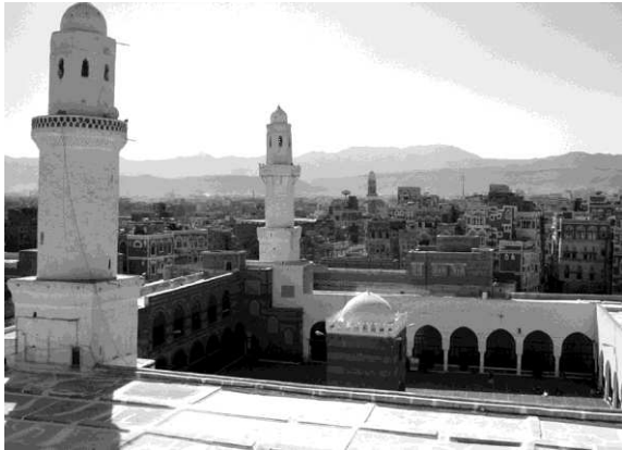
Figure 4. The Great Mosque in San'a, Yemen