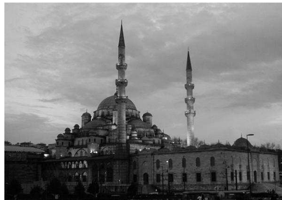
Figure 3. The Eminonu Yeni Mosque in Istanbul, Turkey

Islam teaches, furthermore, that nature’s resources and forces are gifts granted by God to man. “The gift, however, is not transfer of title. Man is permitted to use the gift for the given purpose, but the owner is and always remains Almighty God” 21 .