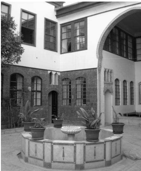
Figure 5. A courtyard house in Damascus, Syria