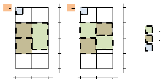
Figure 1. Criteria STD based on Minister's Decree

Xerophyte is a plant that grows in hot dry climate. Both of these plants have a high resistance to drought.