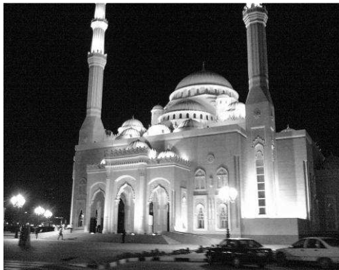
Figure 1. Masjid al-Noor street façade

elements and new building technologies. With its explicit references to imperial Ottoman architecture, the mosque also repudiates narrowly nationalist and post colonialist agendas, instead suggesting a wider Islamic remit for contemporary mosques regardless of their location. The reverence for the classical Muslim past that informed 19 th century revivals is clearly no longer present here, just as the idealized nation-based citizen implicit in older institutions has been replaced by today's alienated and geographically mobile individual.