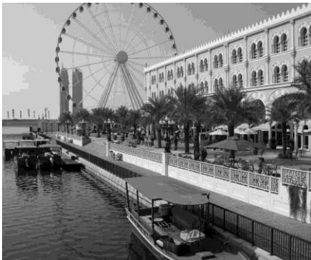
Figure 3. Al-Qasbah

is also made to the recently restored caravanserai of Rustam Pasha. Here, stone work was patterned in alternating bands to display differences in stone colour outlining architectural shapes and forms, and this same strategy appears in the Museum. However, such polychrome panelling in stones and marbles have deep historic roots that extend well beyond the times and spaces of Ottoman and Mamluk monuments. These were, for example, especially popular in Byzantine buildings, and their use in the Museum reinforces a sense of expansive and inclusive historical referencing. This is also suggested by the use of large arched windows covered with grills combined with smaller arched windows on the upper floor, which are classical combinations found in vaulted structures across a wide range of Muslim monuments.