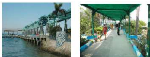
Figure 1.6 The pier facilities on the Untung Jawa Island

The Island is facilitated by piers to support the sea access from and to the ports of Jakarta and Tangerang. This facility, which is the best of all piers in the Seribu Island area, plays an important part in creating increasing the growth of tourism activities in the area. The pier facilities can be seen in Figure 1.6.