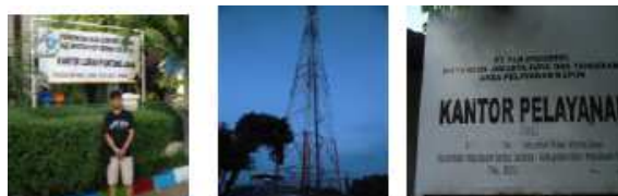
Figure 1.3 Existing facilities in the Untung Jawa Island

Economic empowerment in managing both the human and natural resources in the island could redistribute the tourism income, between the regency and the people who run the tourism service. Housing conditions and infrastructures in the Untung Jawa Island can be seen in Figure 1.3.