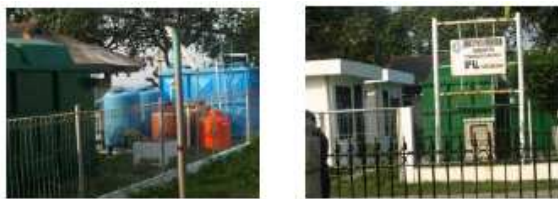
Figure 2.1 System WMI (Water Management Installation)

The Untung Jawa Island has a good example of drainage and waste management system.