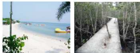
Figure 1.5 The Tourism potentials of the Untung Jawa Island

Natural richness of the Untung Jawa Island can be seen in Figure 1.5.