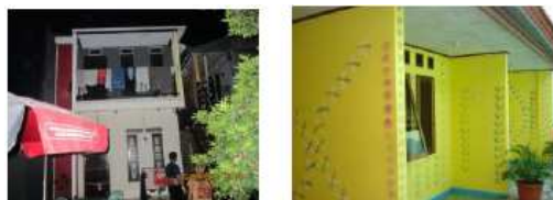
Figure 1.4 The settlement conditions in the Untung Jawa Island

In addition, the houses in the island are not only designated for settlements purposes, but also for tourism purposes (providing bed & breakfast, motel). From the results of their travel megelola earn to make ends meet. Settlement conditions can be seen in Figure 1.4.