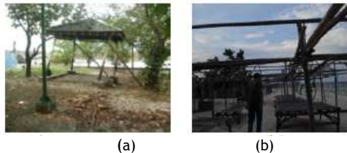
Figure 1.8 Public facilities are not maintained

In general, existing public facilities on the Seribu Island is sufficient but there are some facilities which need more improvement in order to support the daily life of the locals and the tourists. This condition can be seen in Figure 1.8.