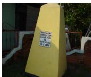
Figure 1.2 The monument of the returning of the Ubi Island's inhabitants to the Untung Jawa Island

The Untung Jawa Island (Kherkhof Amsterdam) has been inhabited since the 1930's when a group of villagers led by Bek Marah, one of the first village chief, migrated from another island that had been hit by a heavy abrasion. However, many years later, these people under the new chief, Bek Saenan, had to migrate to another island, the Ubi Besar Island, around 1940 due to mosquito attack on the island that had created massive suffering to the people of the Untung Jawa Island. Finally, they returned to stay on the Untung Jawa Island in 1954 until now as marked by a monument shown in Figure 1.2.