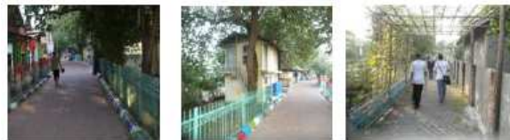
Figure 2.4 The condition of the streets on the Untung Jawa Island

The Untung Jawa Island has a decent road access. Most of them uses paving blocks that would easily absorb water as another example of the island's drainage system. In addition, the use of paving blocks could be effeciently maintained and repaired that shows the sustainability of the infrastructures.