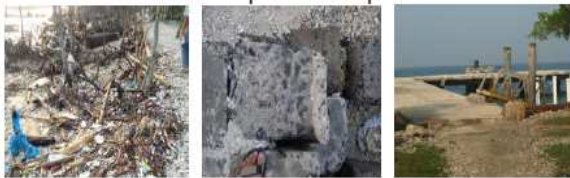
Figure 1.7 The condition of infrastructure on the Untung Jawa Island

There are three interrelated factors that need to be considered in developing a sustainable tourism, namely economic, social and the environment 1 . On the contrary, several infrastructures in the island have been damaged, such as its beaches, breakwaters and piers. Most of the dikes have been exposed to corrosion due to the contact with the waves. Less preservation of existing infrastructure that threatens the existence of the Thousand Islands. These conditions can be seen in Figure 1.7.