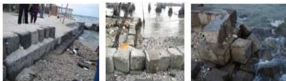
Figure 4.5 The condition of the breakwater structures in the Untung Jawa Island

The breakwater is another important infrastructure required by the Untung Jawa Island. It could reduce the amount of strong movement of waves before entering the mainland. The structure of the breakwater must be made of corrosion-resistant material so that it could hold the movement of sea water.