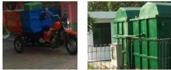
Figure 2. 2 The waste management system on the Untung Jawa Island

Moreover, the island also has a garbage processing system from collecting, transporting and processing in fact, the people of Untung Jawa Island has their traditional way of managing waste: they get rid of their household waste by burying it in their yard. In addition, incinerators provided by the government have also increase the performance of the waste management in the island 2 .