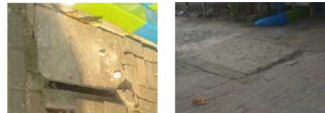
Figure 2. 3 the Drainage control utilities on the Untung Jawa Island

To control the sewers that carries water waste from the houses, the island has a control tub. It could help to remove wastes that obstructs the flow of the water to the sea. The condition can be seen in Figure 2.3.