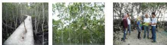
Figure 4.6 The Mangrove forest around the Untung Jawa Island

Typical mangrove area can be developed on the island of Java Profit. The existence of mangroves that cover part of the coast must be maintained properly. Visitors will feel comfortable and interested in exotic mangrove forests. The visitors can be invited to tour through the bridge that has been built to enjoy the uniqueness of mangrove plants. Surround the mangrove forest conservation through the streets winding walkways, on either side of many mangroves are being bred. Occasionally there are also items that occupied people for selling food & drink. With Lucky charm owned island of Java, really make anyone feel lucky've been to this island. Should be a lesson for tourists on this plant for humans and the lives of the Indonesian people.