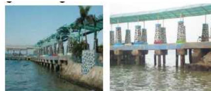
Figure 2.5 The structure of piers on the Untung Jawa Island

The piers on the island really supports the mobility from and to the Untung Jawa Island. They are susceptible to damage caused by waves, corrosion by sea water, the low quality of materials, the structural strength and others. In order to keep the the piers in a good condition, they should be inspected regularly.