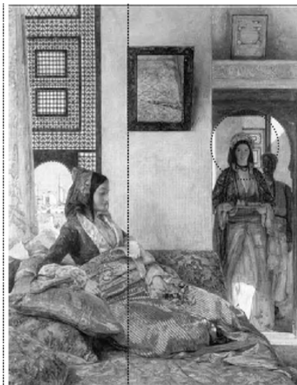
Figure 13. Life in the Ḥarīm, Cairo, 1858

small area because the rest is covered with white fabric perhaps used to save the fine material from fading in the light 69 . In fact, this is the traditional way of dressing such cushions with white lace or transparent muslin in order to unify the row and hide the edges of each cushion; but not, as claimed earlier, as protection from the light.