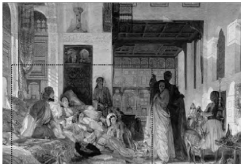
Figure 7. The Harem, Cairo . 1849. (Source: Benjamin, 79)

Another J.F. Lewis painting of the ḥarīm, which is believed to be a fragment of the previous one, is in the Victoria & Albert Museum (see Figure 8). It is similar to a portion of the original painting of The Harem 57 . The same scene is depicted, for the third time, in oil with a different message to that of 1849. An Intercepted Correspondence , 1869 (Figure 9) has almost the same setting as The Harem , with some other architectural details of the room in a wider perspective, though the Bey is older. The Study of the Harem (Figure 10) is more like an incomplete watercolour painting or a sketch. This coloured sketch is now in Australia, and is believed to date from 1850. The finished painting, of almost the same scene of the study, is in the Birmingham Museum, called The Harem 58 , and is undated (Figure 11). However, the painting seems to be the reverse of the previous one of The Harem , unless it is the other side of the same room in J. F. Lewis's house. The scene shows the entrance of the room, which could be another part of the artist's house. This portion of the painting is also depicted in many of J. F. Lewis's paintings.