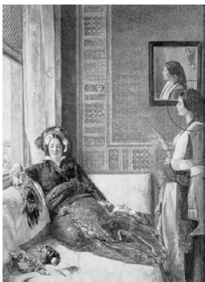
Figure 12. Ḥarīm Life in Constantinople, 1857

[t]he rooms are all spread with Persian carpets, and raised at one end (my chamber is raised at both ends) about two feet. This is the sofa, and is laid with a richer sort of carpet, and all around it a sort of couch, raised half a foot, covered with rich silk according to the fancy or magnificence of the owner. Mine is of scarlet cloth, with a gold fringe; round this are placed, standing against the wall, two rows of cushions, the first very large, and the next little ones; ... They are generally brocade, or embroidery of gold wire upon white satin:- nothing can look more gay and splendid. These seats are so convenient and easy, I shall never endure chairs as long as I live. 67