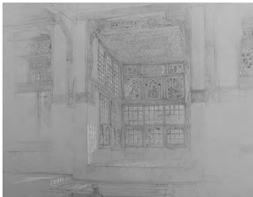
Figure 5. The Recess in a Chamber of the Painter's House in Cairo . 1840s.

JF. Lewis depicted the same scene shown in The Recess in a Chamber of the Painter's House in Cairo , in the 1840s (Figure 5). This chamber scene that Thackeray also described is inscribed as ' Mandarrah of my house at Cairo ' of 1840-51. This study is believed to be developed into another painting ' The Reception ' in 1873. Although the painting of this chamber is believed to be a study of JF. Lewis's own house in Cairo, the painting could also be seen as an amalgam of the studies of Cairene domestic interiors. The house could be the same house which was later occupied by another British resident in Cairo, Mr Lockwood. It was visited and drawn by Thomas Seddon 51 in 1854 as Interior of the Deewan 52 .