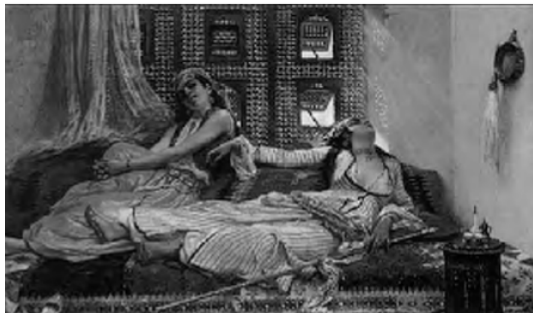
Figure 3. Interior of an Egyptian Harem. Eugene Giraud. (Source: Thornton, Women, 28)

Orientalists' projection and imagination have resulted in the distribution of enormous quantities of representations of the ḥijāb in clothing and architecture outside the Islamic world. The widespread consumption of these images in the West suggests that the 'East' existed solely for the pleasure of the Orientalists, and that they might invent it as they saw fit. The seclusion of the ḥarīm has always been a challenge for travellers who lack the understanding of Islamic culture. This misapprehension applies to female and male travellers alike. Thus, images from inside the house show the ḥarīm and women in unrealistic scenes. The ḥarīm and its lattice wooden window become a stage for the Orientalists' imagination and fantasy, a stage for their daydreams of their own version and interpretation of the Arabian Nights 28 . Such scenes are to be seen in Eugène Giraud's paintings: Interior of an Egyptian Harem , n.d. (Figure 3) and Lord of the Harem , n.d.