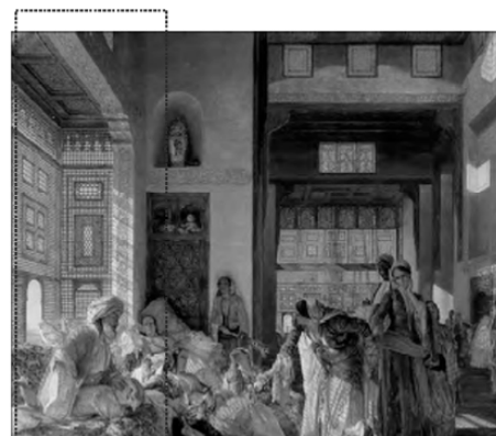
Figure 9. An Intercepted Correspondence , 1869.

Another small detail, which is rarely seen in domestic scenes in the Islamic world, is of a dog lying down in the same seating area as the inhabitants. So that the place could be kept clean and ready for people to perform their prayers anywhere, dogs have never been kept inside the house 59 . The depiction of the dog indoors is an entirely different issue for J. F. Lewis as an animal lover. It seems that he did not consider the Islamic perspective before depicting this ḥarīm scene; or he included a dog in order to please the public, in this case, the Victorian viewers. In this ḥarīm painting, and in the first painting of 1849, there is a curtain which could be interpreted in a similar way to the use of curtains with the lattice window in Cairo. The curtain in this scene is light and translucent in comparison to the heavy one in the first ḥarīm painting.