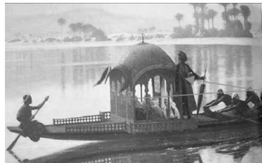
Figure 1. Harem in the Kiosk , 1875-80. Jean-Lean Gerome, Oil on canvas, 76.2 x 111.7 cm. The Najd Collection. (Source: Benjamin, 103)

The fantasy and mystery surrounding veiled women extends to involve the ḥarīm quarter, which is intensively used as an arena for imagining and staging Arabian Nights characters by the Orientalists. Despite these imaginative interpretations, some images link the ḥijāb to women, in instance where a screen, veiled women and a guard would have been a common scene in the Islamic world. Jean-Lean Gerome depicted these elements when women are outside as in Harem in the Kiosk , 1875-80 (Figure 1), and in the Harem Outing , 1869 (Figure 2). Such paintings reflect the double sense of the ḥijāb of women as a veil and a space and the connection between both, in reality and in the mind of the artists alike.