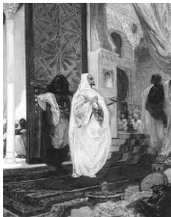
Figure 4. Entering the Harem, 1870s . Georges Clairin. Oil on canvas 82 x 65 cm. The Walter Art Gallery, Baltimore, Maryland.

Hijāb within the house is identified with segregation and not just screening. Segregation in zones within the house, regardless of the varieties in terms of the Islamic regions, also fulfils the ḥijāb concept. However, screening can be seen in the entrance hall when a curtain is hung to break any direct view from the outside. This rule is observed in Islamic domestic architecture, since no direct view or entrance openings are allowed. A barrier is always provided to screen the inner house from direct view. This could be a wall, a curtain or even a courtyard. The guarding of the Caliph's entrance and the women's quarters shows a similar situation as in Entering the Harem, 1870s (Figure 4). Under Islamic moral codes a man, even the master of the house, should make some noise when he enters the house, as there may be female visitors or neighbours in the vicinity. Therefore, to avoid any awkward situations arising within the home, upon entering a room a respectful and considerate man should make some kind of noise (a cough or even a formal announcement of his intention to enter) to alert the women inside of his presence and imminent entrance.