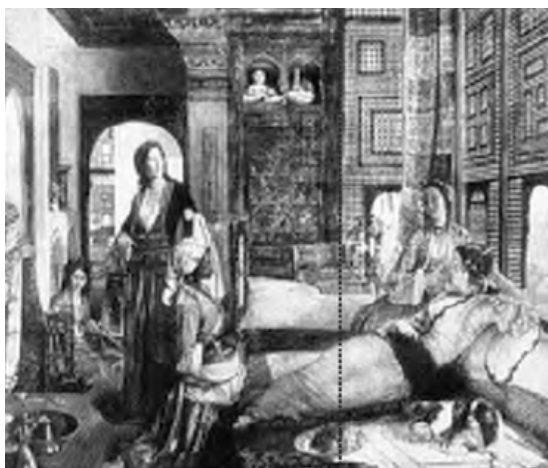
Figure 11. The Hareem, Cairo. n.d.

The Reception was executed in 1873 (Figure 6), a decade after JF. Lewis's return to England. The painting is mainly based on Mandarrah of my House at