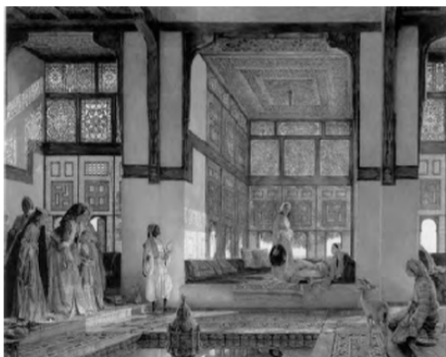
Figure 6. The Reception , JF. Lewis, 1873.