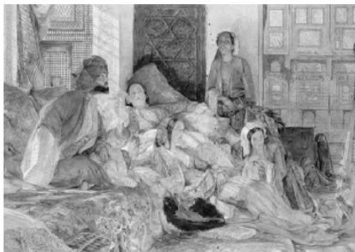
Figure 8. The Harem 1850, the fragment version in the Victoria & Albert Museum.

By comparing the sketch and the painting of the ḥarīm and its study, some different details can be identified. The final painting is in oil, which means that the painting could have been executed sometime after 1858, when the painter changed from watercolour medium to oil. The proportion of some of the architectural elements varies in the sketch; for example, the wall beside the wardrobe works as a background for the standing woman and as a space before the entrance arch. More importantly, the scene demonstrates that the lattice wooden window within the ḥarīm is big enough to accommodate a group of women within. Through the arch there is another view of the lattice window from the front. This painting, and the other of the ḥarīm shows that the house is full of these lattice windows which are depicted from different views, at close range and at a distance. These paintings are clear indications of J. F. Lewis's passion for these wooden screens and their impact on the interior both architecturally and socially. Doubtless, such screens are indications of the importance role of the ḥijāb in the Islamic house, and in the ḥarīm in particular.