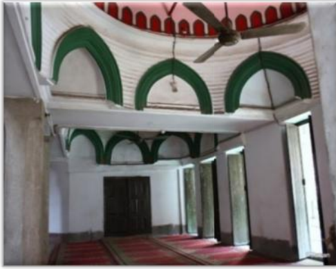
Figure 9. Binat Bibi Inside [29]