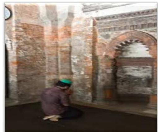
Figure 11. Bâbâ Âdam, Shahid Mosque Inside [33]