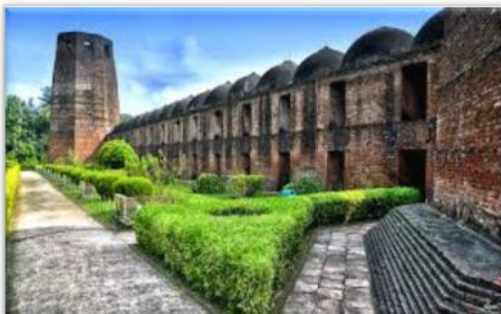
Figure 17. Katra Mosque [33]