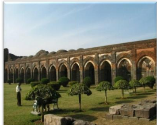
Figure-3. Adina Mosque [20]

into 2 aisles and five bays by a row of four stone pillars that originally supported 10 domes, now all fallen. Corresponding with the aisles and bass respectively, there are two arched doors each on the northern and the southern side, and five arched doors in the eastern wall in line with five mihrabs in the western wall. The parapet and corrier are curved. The façade is plain except for the bands of mouldings on the walls and the offers a towers. Here discussed some important mosques during the Muslim period: Some Grand Mosques in Bengal during the Muslim period (Pre Mughal- Mughal Period): Adina Mosque (1373 A.D.) In Fourteenth century: