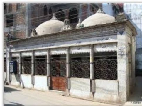
Figure 8. Mosque of Binat Bibi [29]