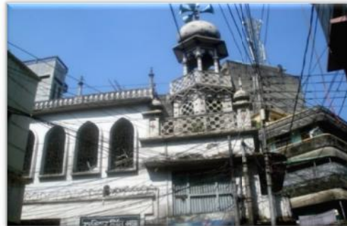
Figure 14. The Churihatta Mosque [37]