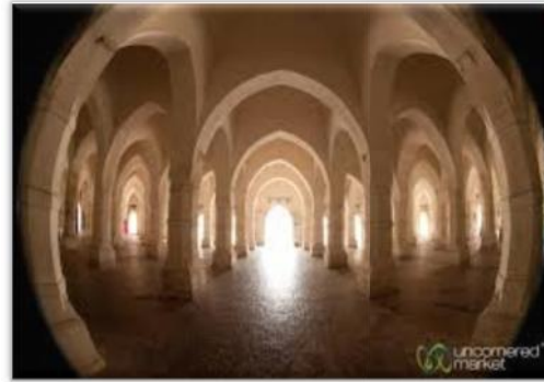
Figure 7. Sath-Gumbad Mosque Inside [26]

The red brick mosque of sixty domes built by a local ruler Khan-I Jahān Ali , is a massive structure of considerable dimension. The Liwān measures 160ft. from north to south and 108 ft. from east to west. The façade on the east has eleven slightly recessed, two-centred arched openings or doorways, while each corner has been strengthened with batter towers surmounted with dome lets. The central opening is slightly higher than the others. Above, a cornice runs all through the length of the front-end, while the central arch has a triangular pediment. Internally, the chamber is divided into eleven aisles from north to south, and seven from east to west, while the western wall has been provided the mihrabs in the shape of two-centred, engrailed arched recesses. The domed roof is raised on slender octagonal pillars of stone. Seven central bays have pyramidal domes, but the others are surmounted by hemispherical domes. The square shaped aisles have been divided at the top into octagons by means of pendentives erected with corbelled brick work. The mihrabs are conceived of a gate-like framework having decorative floral patterns in low relief [27]. It is now a pilgrimage site where people pay homage to the man who dedicated his lifetime to build the city and its monuments. The Pir Ali Tomb (of Pir Ali , a close associate of Khan Jahan ) is an annex building of this mausoleum and is of identical layout. A mosque called the Dargha Mosque is attached to the mausoleum [28].