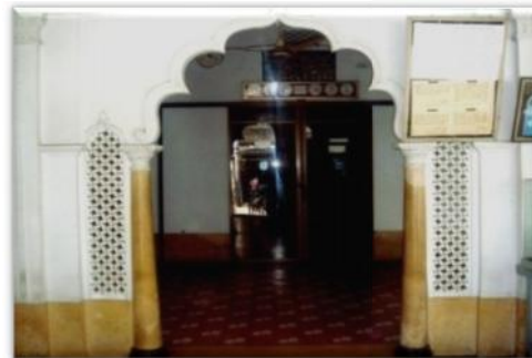
Figure 15. Churihatta Mosque Inside [37]

The Churihatta quarter of the city near the chauk is situated Churihatta mosque, which is characterized by bungalow type of roof, so much spoken of in the Baharistan-i-Ghabi . The mosque was built by a Mughal officer, Muhammad Beg in 1649, when Prince Shah Shuja was the viceroy of Bengal. The mosque's rectangular in plan with towers at the four corners. The eastern side has three doorways, each of which opens through two successive arches. The façade is marked with numerous square and rectangular panels and the cornice, which is straight, is faced with blind merlons . The interior hall is covered with an intersecting vaulted roof, the line of intersections is curved and so is the central ridge. But this vaulted roof is a development from the north Indian pyramidal type. It has no long drawn eaves as found in the Bengali type. The mosque is now renovated [27].