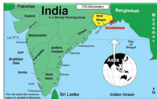
Figure 1. Map of India (Asia continent) indicate the position of the Bengal, after 1947, partition of India Bengal divided into two parts: west Bengal (India) and Bangladesh (Independent country)[6]

complete sway. This region, which henceforth bore the name of Sultanate –i-Bangala or Subah-i-Bangala , was in the past surcharged with Hindu-Buddhist spirit, but now it felt the impact of Islam. The early Arab contact with the Bengal coast has left no recognizable remains on the surface, except a faint memory in 'Buddermokan' associated with the Muslims as recorded by Harvey. The influence of Islam in the cultural field was gradual but definite, and as a result of the clash of its ideals with those of the earlier forces, we find the people of this region coming within the fold of Islam in such a great number that the whole atmosphere of this humid land today breathes in the spirit of the desert-born Islam. The Muslim had come to Bengal with their developed civilization of Islam as their heritage and they meant to settle down in the country in order to establish a new home for themselves. The caries of this civilization, who mostly Turks, had themselves were uprooted from their homeland in Central Asia and they came here as squatters to make a bid for a new career in their life. They introduced the new martial vigor and the great heritage of the Islamic civilization that they brought in their train, but how these new elements fitted into the ever-recurring humid climate of Bengal, is a long history [5].