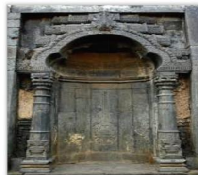
Figure 5. Mihrab (prayer niche) at Adina Mosque [22]