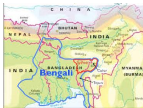
Figure 2. Position of Bengal (Indian Subcontinent)[7]

An attempt is made here to understand this phenomenon in the field of architecture, which expresses but one aspect of human life, but it is the most important in so far as it is a social product