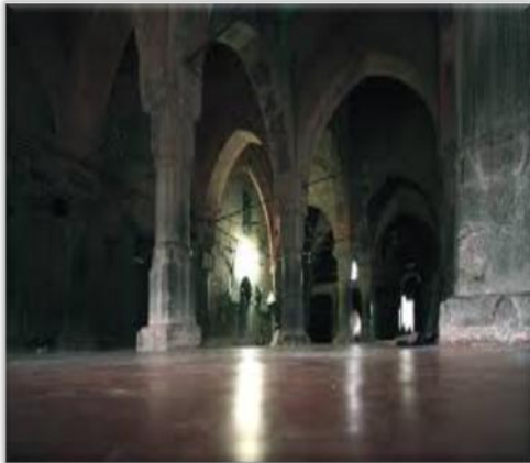
Figure 13. Chhota Sona Mosque Inside [35]