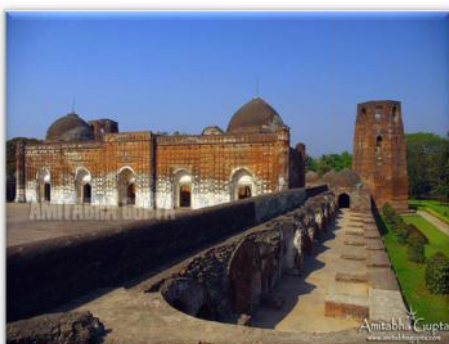
Figure 18. Elevated View of Katra Mosque alias Katra Masjid [40]