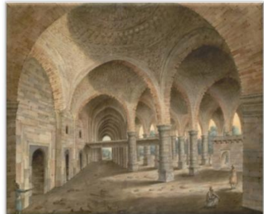
Figure 4. Adina Mosque Inside [21]