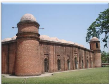
Figure 6. Sath-Gumbad Mosque [25]