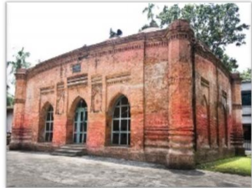
Figure 10. Bâbâ Âdam, Shahid Mosque [33]

mihrabs is the shape of engrailed, two centred arched-niches richly decorated [31]. There is a grave of a saint of Muslim named "Baba Adam" just beside the mosque. It's heard from the people that, during the ruling period of Ballal Sen, "Baba Adam" came to that place to spread the religion Islam. But "Baba Adam" was killed by the order of "Ballal Sen", and he was buried here later on [32].