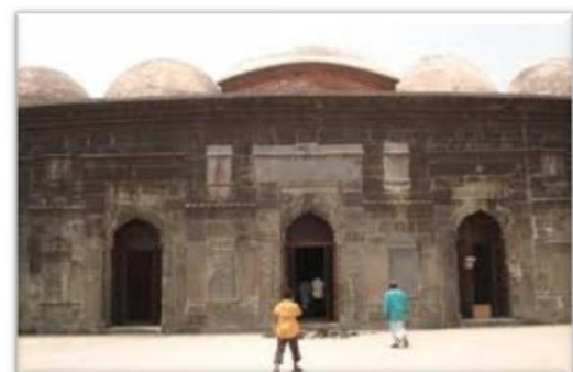
Figure 12. Chhota Sona Mosque [34]