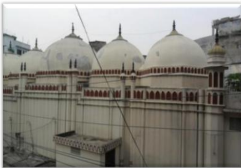
Figure 16. Mosque of Kartalab Khan [39]

erected a mosque at Dacca, known after his name. The Mosque is undoubtedly one of the most impressive Mughal structures of Dacca, having been built on a high platform called takhana . There are vaulted rooms underneath, which are now being used as shops. Unlike the tree-domed mosques of Khan Muhammad Mirdha , it is roofed over by five domes resting on octagonal drums. The most curious architectural feature of the Mosque is the do-chala or two-segmented hut-shaped structure, adjoining the mosque on the worthy, which is used as their residence of the Iman . There was a stepped well or built about the same time in the courtyard of the mosque [38].