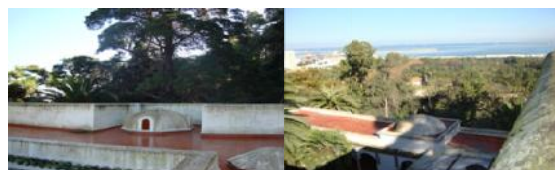
Figure 7: Views of the various green spaces from the main residence of the Djenane Abd-el-Tif