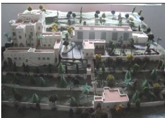
Figure 2. The architecture of the djenane Abd-el-Tif (Source: Cabinet d'architecture de design et des technologies de construction Photo: Personal collection (model of the djenane Abd-el-Tif), 2012)

Esquer [15] confirms that, like townhouses, the interior of these villas was decorated with tiles and carved woodwork. The latter had bigger rooms and courtyards, while the exterior of countryside villas was more welcoming. As country villas were isolated and without vis-à-vis, the windows offered a wide view over the garden, which became the