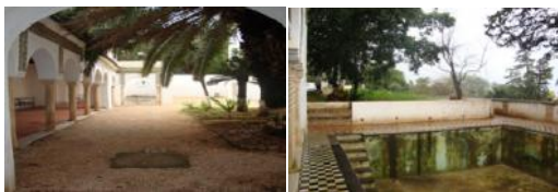
Figure 3. Small areas of the Djenane Abd-el-Tif used for relaxation and strolls

The organization of the garden of the djenane Abd-el-Tif is based on that of Islamic gardens. It is linked to its function as a place of relaxation and family walks, and not as a place of political and official meetings. It is therefore arranged into many dynamic, small spaces. These small spaces consist of the riad where the ornamental pond opens onto a green space, the greenery in the internal courtyard, and the gardens that slope away from the main building (Figure 3).