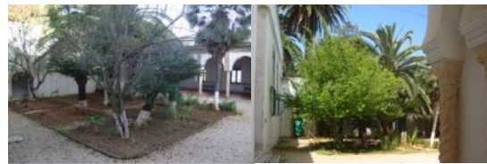
Figure 5. The symbolic meaning of planting at the Djenane Abd-el-Tif: Deciduous trees as symbols of the cycle of existence

The composition of Islamic gardens was characterized by rectilinear planting along alleys and in their sub-spaces. Certain trees were planted not only for the shade they provided (in a country known for its great heat), but also for their symbolic meanings. Evergreens (palm trees) represented the eternity of God, deciduous trees (such as the oak) represented the cycle of human existence (birth, life and death), while plants, like human beings, are born, live and return to the earth. The gardens of the djenane Abd-el-Tif follow these principles (Figure 5).