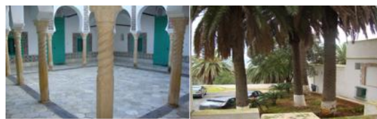
Figure 6. Continuity between the garden and the residence at the Djenane Abd-el-Tif: The allusion between the columns of the house and the trunks of the trees found in the garden

In a similar vein, all of the views from the main residence of the djenane directly overlook the various green areas surrounding the house (Figure 7).