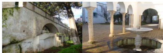
Figure 8. The use of water in the various spaces of the Djenane Abd-el-Tif

meditation on the generosity and power of God, eternity, and the life cycle of the human being.