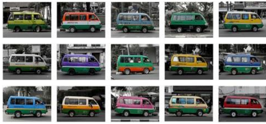
Figure 2. Paratransit colors interpret its specific route [26]

will only affect charging schedule since the charging should be done earlier and shorter (when SoC is smaller) or later and longer (when SoC is bigger).