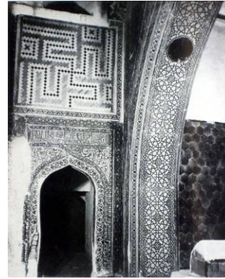
Figure 4. Grand arch and door in Mausoleum of Sahib Ata, Konya, 1258-83

In regard to the morphology of Islamic art, geometrical nature of arabesque is emphasized 37 in a series of studies. The geometrical richness of Islamic art which stems from the blend of organic and geometric, subjective and objective conception of nature through the interplay of illusion, function and dynamic interlacing 38 is elucidated by means of the analysis of the visual language of arabesque 39 in terms of its relation to numerology and semiology. Within the scope of shape grammar studies, which analyse the underlying grammatical structure behind the shapes 40 and their relation to socio-economical and socio-political contexts 41 , Islamic art has been the focus of various studies that intend to derive generic models 42 for their underlying geometrical logic 43 . All these studies reveal the underlying structure of arabesque ornamentation as a complex system accomplished through successive combinations of simple forms in very similar way to the fractal structures.