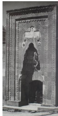
Figure 2. Portal of Alaaddin Mosque, Nigde, 1223 (Source: Akurgal, E., 1980, The Art and Architecture of Turkey , Rizzoli, New York, p.106)

At this point it would be appropriate to elucidate the etymological roots of the terminology in regard to its relation with Turkish art. As a matter of fact, the word "arabesque" has entered to the language of Turkish long before the Republican era, and was defined as 'Arabian style of decoration, a complex and bizarre fusion of various decoration elements'. An ambiguity of definition is observed in