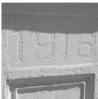
Figure 1. Date (1916) written on the walls of the Air Baruk Mosque gates