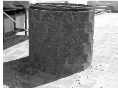
Figure 24. Water wells of the Air Barok Village Mosque

These wells are used for ablution before the pits been build or after the wells has been constructed, the pits are no longer in use. Well construction materials that are cylindrical brick plaster is unique to show the beauty of the bricks used as construction materials (Figures 24, 25).