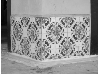
Figure 10. Finishes the beautiful tiles on the bottom of the concrete wall

Building material for wall base (foundation wall material) and the wall of the raw material used is concrete bricks in the outer plaster. In addition, the wall which is also decorated with a tile pattern (Figure 10). Tile material is originated from Italy and have certain privileges.