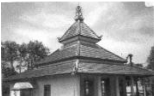
Figure 7. Angular view of Air Barok Village Mosque

The mass of the mosque is shaped in such a way having a tiered roof. It is an example of the main elements of the architecture of building of a mosques in Melaka. A view of certain corner of the mosque are shows on this picture below (Figure 7 - 9).