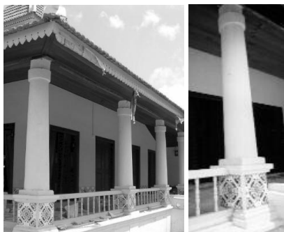
Figure 12. On the porch column