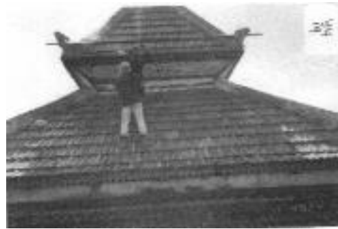
Figure 8. View towards the upper part of Air Barok Village Mosque