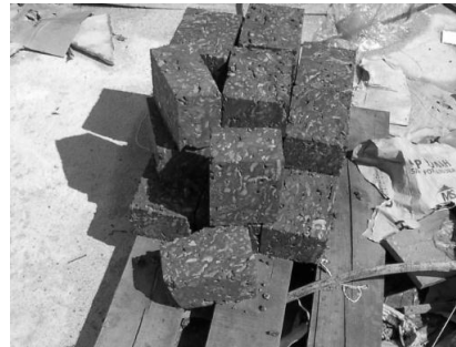
Figure 25. Construction materials used as well finish