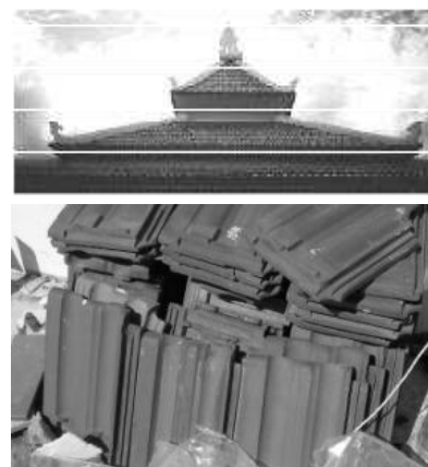
Figure 14. Roof of the Mosque Air Barok Village (above) and materials used (below)

This is the type of roof mosque called roof Meru . In terms of suitability to the climate, the roof rise should facilitate the process of ventilation. But the function of roof ventilation components to suit the installation does not work because there is a ceiling on the mosque. Roof design is based on the architectural design of mosques in the Archipelago that uses elements of the tiered roof ventilation agent. Due to the lack of understanding; the function of this multilevel roof design used in this mosque shows the image without emphasizing the function of design. Finishes on the roof is from pieces of roof tiles called 'marsile' made from clay (Figure 14). The fascia board of the building made of the board with engraved pattern.