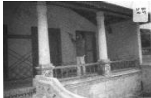
Figure 9. The Verandah; side view of Air Barok Village Mosque