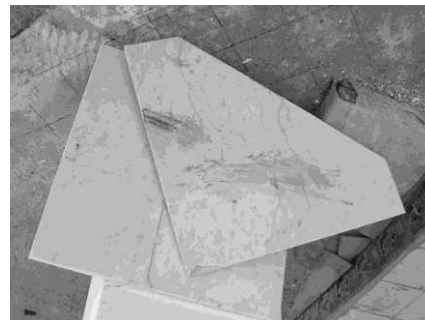
Figure 19. New marble tiles used as floor finishes