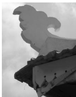
Figure 16. Stem/‘Salur Bayung’ at Air Barok Village Mosque

The ‘Salur Bayung’ of Air Barok Village Mosque is in the same shape with other traditional mosques in Melaka. Its ‘Salur Bayung’ is made of concrete. The ‘Salur Bayung’ feature is inspired from the stem were taken from a wild plant in the water. It also reflects the first time of ‘tahhiyat’ in the prayer. If carefully viewed; in this ‘bayung’ stem; one can noted that the image of a pagoda in the design of this mosque. This view enhanced the fact that design elements of the mosque have influenced of the Buddha in it (Figure 16).