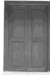
Figure 17. The detail of the window

17). Similarly, the door of the mosque is in the form of an empty flat and finish with flat board.