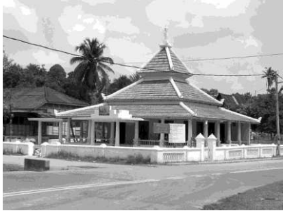
Figure 6. Masjid Kampung Air Baroque, as it is now

There is a major component in the construction of a mosque as described in this analysis report which is the main components of the mosque. Analysis made on this mosque is based on a heritage survey provided as guidance by Badan Warisan Malaysia (Malaysia Heritage Board). From the analysis made, Air Barok Village Mosque has heritage features and the architecture of the mosque constructed within the Nusantara Archipelago vocabulary. The building was undergoing conservation work and retention of original design by the Department of Museums and Antiquities (see Figure 6). In terms of suitability to the climate, the roof rise and there is some kind of louvers around the façade to facilitate the process of building ventilation. The orientation before the Qiblah (in Mecca, Saudi Arabia) which is a common principle used in the construction of each of the mosques. Hopefully, further metric study of this Air Barok Village Mosque will be made and described in the next section study.