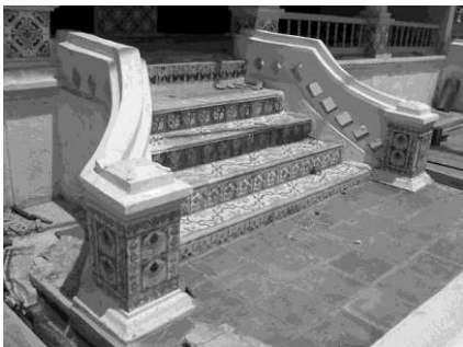
Figure 28. Stairs at the entrance of the mosque side