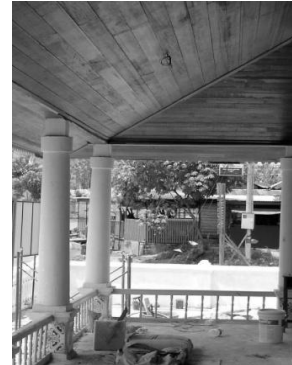
Figure 13. Mosque of Air Barok's porch

There is an open verandah area at the mosque around the sides and front facade. It is surrounded by 'balustrade' of concrete and several columns as described above (Figure 13). There are also front yard installed with terracotta flooring at the outside of the building.