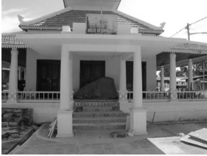
Figure 26. The main entrance of mosque