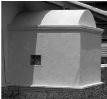
Figure 21. External view of the sanctuary of the mosque