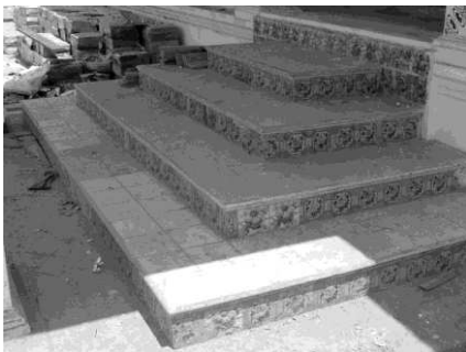
Figure 27. The stairs at the main gate

Like the concept of traditional Malay houses are commonly found in Melaka, treated as the aesthetic elements to invite guests in its design. Similarly with this mosque, this types of the concrete stairs is having very exciting finish tiles seem to invite people in the mosque. At the main entrance, the stairs (Figure 27) seems longer compared to the side entrance and the main entrance's stairs having special features and design finishes. This is possible because there are strong elements of the main gate entrance to show-off. In contrast to the more hidden stairs located on side entrance, the design steps (Figure 28) is less interesting in term of its design finishes tiles.