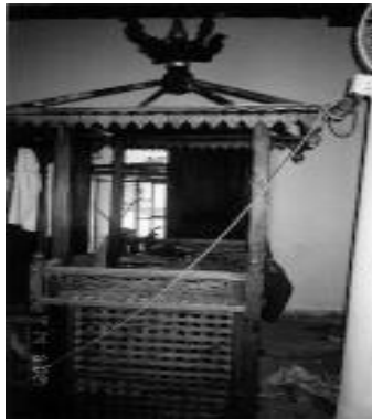
Figure 22. Air Barok Village Mosque pulpit

For the pulpit, the mosque has decorated ceiling decorated with interesting sculptures become an important component of the mosque and became a preacher sermon during the weekly Friday Prayer (Figure 22).