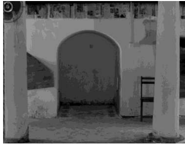
Figure 20. The views of the mosque sanctuary