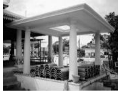
Figure 23. The pits at the mosque