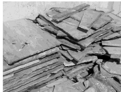
Figure 18. Original marble tiles as floor finishes being removed

Floor finishes are of a large marble tiles. It was bought from Italy as explained earlier (Figure 18 and 19).