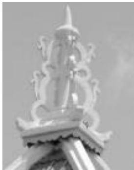
Figure 15. The Crown Air Barok Village Mosque

Crown (instead of dome) is the most special item for each Traditional Melaka/Malacca Mosque. Like other mosques of Malacca which is consisted of three levels of the ridge, the crown is one of the arts of the Malays who poured into the sacred building. Each level represents a certain level. Air Barok Village Mosque crown is made of concrete materials. If you see this section in the mosque of Air Barok there is Buddhist influence in its design. The pattern form resemblance of the modified abstracted dragon image (Figure 15).