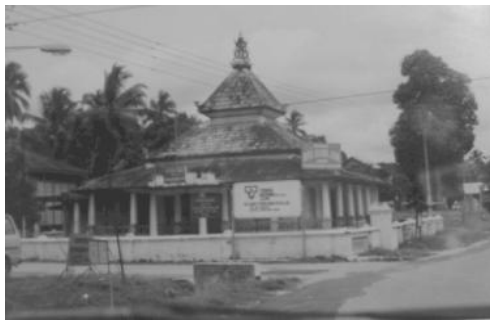
Figure 4. Air Barok Village Mosque was found by the Department of Museum Antiquities that is not used anymore in 1989

wealthy people who lived near the area. From an interview with Tan Sri Aziz Tapa (a well known local political veteran), the material of the construction of this mosque ie the tiles, was bought by Haji Babu from Medan, Sumatera. These building materials are those of the collapsed Deli Palace in Sumatera. However the mosque's marbles are believed to be brought from Italy and are believed to be purchased for the construction of the mosque. According to the villagers again, the construction of belian pillars ( belian is the type of local timber) is in addition to supporting the roof; is donated from unidentified wealthy person. Namely, each belian columns have their own donors who supported the construction of those belian pillars.