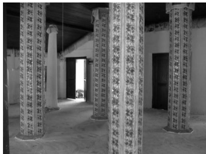
Figure 11. The belian pillar pole tidy-up with colorful floral motive tiles designed as a whole

There are two types of columns/pillars in the mosque. The four pillars of the belian type (the term for the pillars supporting the roof of every mosque in Archipelago/Nusantara region) (Figure 11) on the inside of the mosque is decorated with a concrete pillar with tile pattern on its whole surface. For columns on the porch located outside; also having decorative feature at the bottom of the concrete pillar (Figure 12).