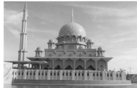
Figure 10. Putra Mosque

As regard to their massing composition, Masjid Negara settles on an assymetrical approach in contrast to the imperial symetery of the Putra Mosque. Thus Masjid Negara presents an informal invitational gestures to worshippers in contrast to the stiff and regimented tones of the Putra Mosque (Figure 10).