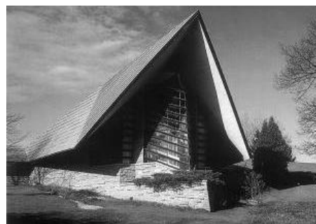
Figure 5. Unitarian Church

Wright was never an advocate of revivalism nor was he ever known to condone eclecticism in any form whatsoever 8 . From his Prairie School period to his 'Cubist' era and finally to his structuralist preference, Wright had always believed in the idea of 'spirit of the times'. The idea of spirit of the times simply postulates that each building truthfully produced in an era reflects the technological prowess and the economic condition of that particular period. Revivalism seek to lie about true conditions and simplistic nostalgic references can never be seriously taken as an important rationale to produce works of socio-political importance.