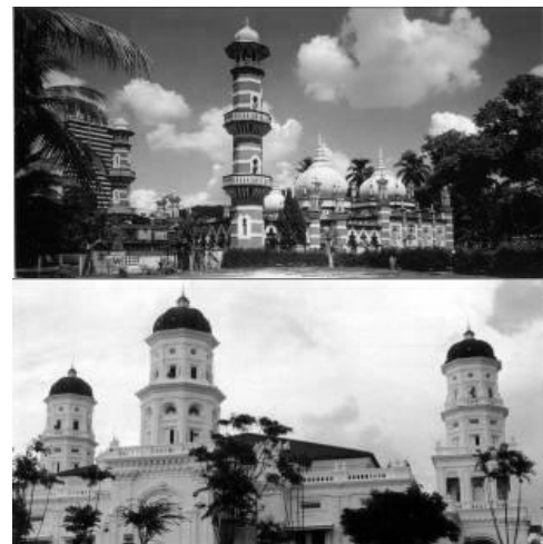
Figure 3. The Jamek and Abu Bakar Mosque

modern international wave swept over Malaysia and brought with it the structuralist and machine aesthetic of mosque designs as can be seen in the Negeri Sembilan State Mosque (Figure 4) and also that of Penang. Post Modern architecture then opened a Pandora box of Egyptian, Iranian and Turkish eclectic revivalism. The Wilayah Mosque, the Putra Mosque are recent epitomes of the grand monumental and over priced structures which the government uses to suggest their symbolic commitment to Islam. More Middle Eastern and Turkish mosques are expected to be making their debut in the short future.