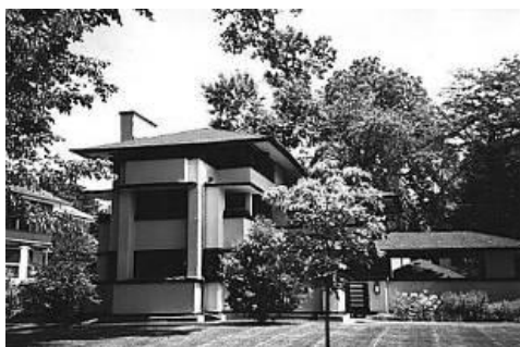
Figure 6. Martin House

Besides the Unitarian Church, lessons can also be drawn from other Wright's work. The Martin house (Figure 6) offers important lessons in the integration of landscaping elements with the strength of organization of spaces. Instead of lumping all the spaces into a single mass, Wright had separated it into three volumes interconnected by passageways. What he has ingeniously done is to provide a leisurely but ceremonious journeys to all the different spaces in the house by encouraging the dwellers to view the plants and trees littered throughout the gardens in the small courtyards created. As with the quoted verses in Surah ar-Ra'd, the mosque can benefit from such a strategy that would not only encourage the reminder of God but also sooth the spirit and cools the building by solar absorption.