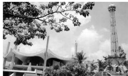
Figure 4. Negeri Sembilan State Mosque