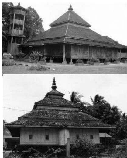
Figure 1. The Kampung Laut (above) and Kampung Tuan Mosque (below)

Since the day Islam set onto Malaysia's soil over seven centuries ago, there have been many kinds of architectural language used in mosque designs. The earliest typology of mosques in this country is believed to be those built purely of timber with the characteristic pyramidal roof of two or three tiers and also those of the long gable house-type. The Kampung Laut (around 300 years old) and Kampung Tuan Mosques are two typical examples of the earliest type of three tiered pyramidal room form with raised floor and an obvious absence of minaret.