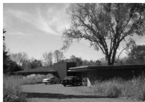
Figure 7. Friedman House

(Figure 7) Wright buries much of the building in the soil for a natural insulation against heat and orients the building to capture the winter sun rays to heat the house. In the tropics such as Malaysia an emphasis to openness and the use of pools of water for cooling and encouragement of convective air currents is desirable. However many mosques disregard this principle and some have even opted for the use of mechanical means of cooling just so that they can use the fortress like images of the middle eastern mosque typologies. Islam encourages actions of conserving resources and abhors wasteful acts of any kind. The Prophet was known to have admonished his followers not to be wasteful in performing ablution even if the water was from an abundantly flowing river.