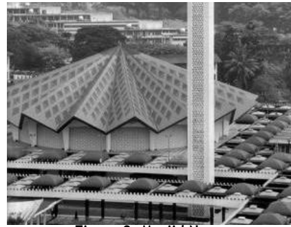
Figure 9. Masjid Negara

With regards to the use of regionalistic response to the climate, Masjid Negara (Figure 9) epitomizes this creed in a wonderful display of serambis or verandahs, air wells, large pools of water for cooling, a generous fenestration area and a depth to height proportion that encourages convective air currents throughout its structure. The Putra Mosque with its small fenestration area, large use of masonry is forced to rely on mechanical means of cooling that wastes energy and resources. The fact that it sits on a man made lake worsens the idea of sustainable architecture in its almost 100 million dollar venture.