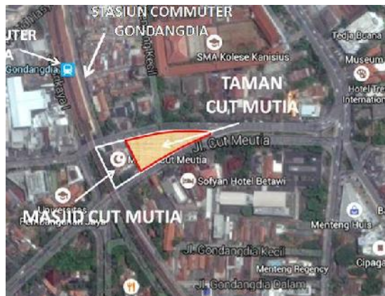
Figure. 2. Location of Cut Mutia Park

The research object is a city park that is united with the Cut Mutia Mosque, in Central Jakarta. It is named Cut Mutia Park that visually seen attached to the main yard of the mosque, so it becomes an extension of the mosque courtyard. Cut Mutia park is public open space filled with lush trees so it looks like an urban forest and become as an important visual object for the people passing nearby.