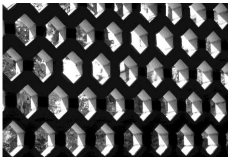
Figure 5. Latticed surface in the entrance hall helps to see the garden before entering there

and formed in the light of what the paths define for the garden. Pleasantness of the garden is derived from its appearance; rhythm, symmetry, and balance, and they are seen in paths. So it can be said that unity in the garden, is shaped on a physical arrangement basis. The entry of Persian garden is an important design consideration in its arrangement. It is the first step in the way to be encountered by the garden. It is strong, well organized and ornamented and inviting so it attracts individuals to experience what the garden has to offer (Figure 5). According to Cox, two or three different forms are all that is needed to keep a garden aesthetically pleasing and relaxing 23 .