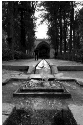
Figure 2. Persian garden (Shazdeh Mahan Garden, Iran, Kerman) in differentiation with its context [26]

other words, one is able to identify an overall picture that is comprised of several different elements or features.