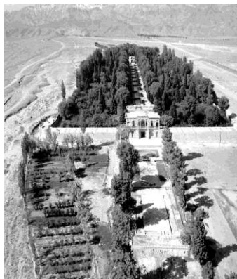
Figure 3. Persian garden (Fin Kashan Garden, Iran, Kashan), water as one of the main elements in Persian garden

Without a sense of connectedness among environmental features, the experience is merely an unrelated collection of impressions and may in fact cause confusion 7 . Legibility in the garden that will explained below by title of "spatial organization" is important spatially in that one is able to comprehend the overall physical environment, can begin to make predictions about other elements that exist or progression that may occur, and may anticipate and seek out these predictions. As Kaplans said, an environment that has an appropriate quantity of things to see, experience, and think about so as to substantially fill one's mind will have a sufficient level of scope 12 . It can be seen in changing of water feature during passing by squirts and cascades and so it has preference in their repetition and rhythm. It can be seen in the rhythm of garden's features and fascination order to its discoveries. Scope is the richness within the space that provides complexity and mystery 6 .