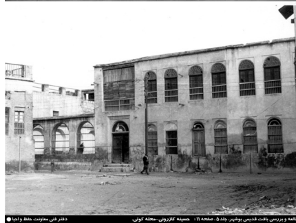
Figure 1. Old and new exterior view of Kazeruni Barheh

Barheh, Baraheh or Hosseiniye was a gathering place for religious ceremonies 50 . Kazeruni Barheh was one of buildings built by Seyyed Mohammad Reza Kazeruni in 1902 in two floors with approximate area of 1000 square meters. Shanbedi mosque that is one of the main mosques of Bushehr city was built at