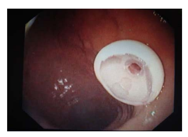
Figure 3. Placement of PEG in the gastric cavity

whenever the patient's oral intake function has returned to normal. PEG tube removal and re-insertion was done at an interval of 3 to 6 months. This was done without general anesthesia.