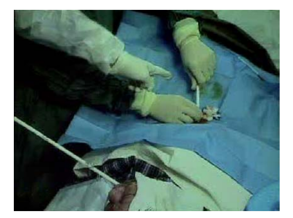
Figure 2. Insertion of the PEG tube