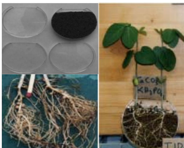
Fig. 1. A rhizotron filled with soil and the lid (left, above); the entire excised nodulated roots (left, bottom); and rhizotron with soybean plants (right).

Many plants can be grown in a limited space, in a relatively short time (less than 3 weeks). And what is more important, the results obtained in rhizotrons are in good agreement with comparable field experiments.