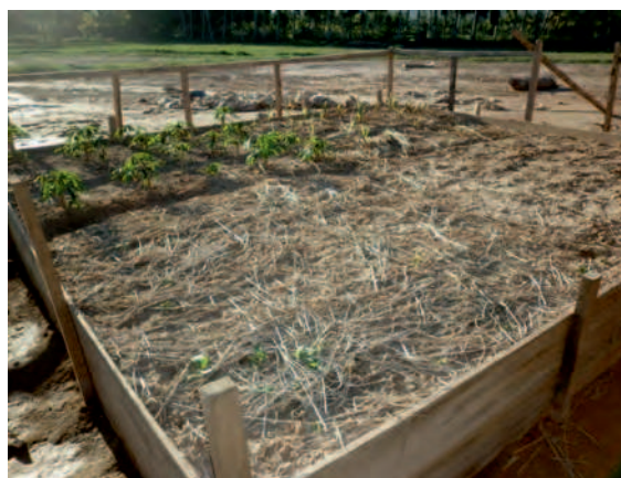
Figure 3. Four spesies growth at cyanidation tailings from ASGM Sekotong, West Lombok, Indonesia.

An early research of gold phytomining in Sekotong of West Lombok District was conducted in 2011. A plot of four different species which were cassava, corn ( Zea mays ), Brassica juncea , and Sunflower directly planted on cyanidation tailing (Figure 3). The Au concentration on the cyanidation tailings was in the range of