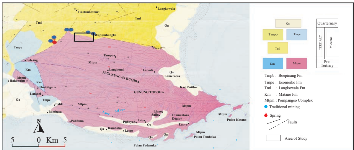
Figure 2. Geological map of Langkowala area occupied by Langkowala Formation (Tml) unconformably overlying Paleozoic metamorphic rocks (Pompangeo Complex; Mtpm) in the south (Wububangka and Rumbia mountain range) (Modified from Simandjuntak et al. , 1993).

of River Tahi Ite in 2008, and more than 20,000 traditional gold miners have been operating in the area (Kompas Daily, 2008). During January 2009, the number of traditional gold miners in Bombana Regency increases significantly and reaching the total of 63,000 people (Surono & Tang, 2009). The secondary gold is not only found in present stream sediments (placer), but also found within Miocene sediments of the Langkowala Formation (paleoplacer). The primary source of Bombana placer/paleoplacer gold is in controversy and it is still opened for discussion. This paper describes a preliminary study on possible primary deposit type as a source of the Langkowala (Bombana) secondary placer gold. This study is an important stage for the next exploration of gold in the area or other areas that have an identical setting of geology.