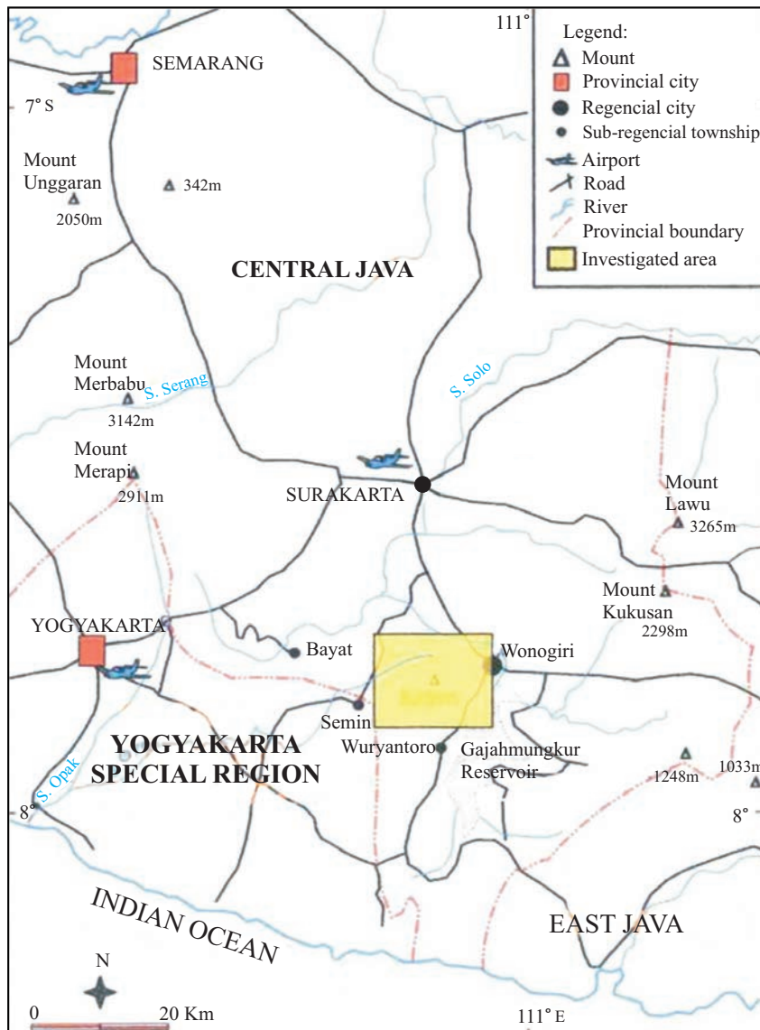
Figure. 1 Locality map of the investigated area, where the Gunung (Mount) Gajahmungkur is situated.

The subaqueously deposition of the volcanic rocks syn-genetically deposited with shallow and littoral marine deposits adds the complication of the stratigraphy of the area. Therefore, the volcanic sequence of Southern Mountain is described as a formation. However the terminology has so far been controversial as among others pointed out by Marks (1957). He further suggested re-describing the terminology. Moreover the Stratigraphic Code of Indonesia published by the Association of Indonesian Geologists is not in favor to such a description (Martojoyo et al. , 1973; Martojoyo and Djuhaeni, 1996).