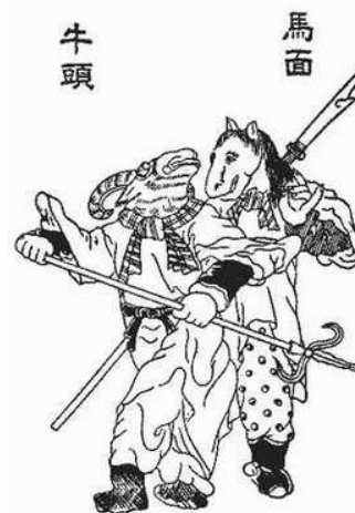
Figure 1: Niútóu and Mǎmiàn 1

In 1368, when the Ming Dynasty was in power, Western missionaries and merchants began to come to China. During their trade and communications, they brought with them many Western books and words. As the books were translated into Mandarin, the idioms also needed adaptation. However, there are relatively few idioms from Western languages in Mandarin. Examples include (11) Yīshí èrniǎo (一石二鸟), which has the same literal and idiomatic meaning as to [to kill] two birds with one stone; (12) Huǒzhōng Qǔlì (火中取栗), which means 'a person unknowingly manipulated by others for a certain purpose' and originates from Jean de La Fontaine's story The Monkey and Cat ; and (13) Xiàngyá Zhītǎ (象牙之塔), which has the same literal and idiomatic meaning as 'ivory tower': it is used to designate an environment of intellectual