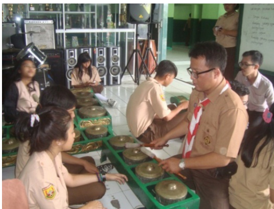
Figure 2. In-Service Teacher Gave an Example to Students (Documentation by Latifah, April 2, 2014)

The results of the study have successfully revealed the roles of in-service teacher to prepare the pre-service teachers, as follows: