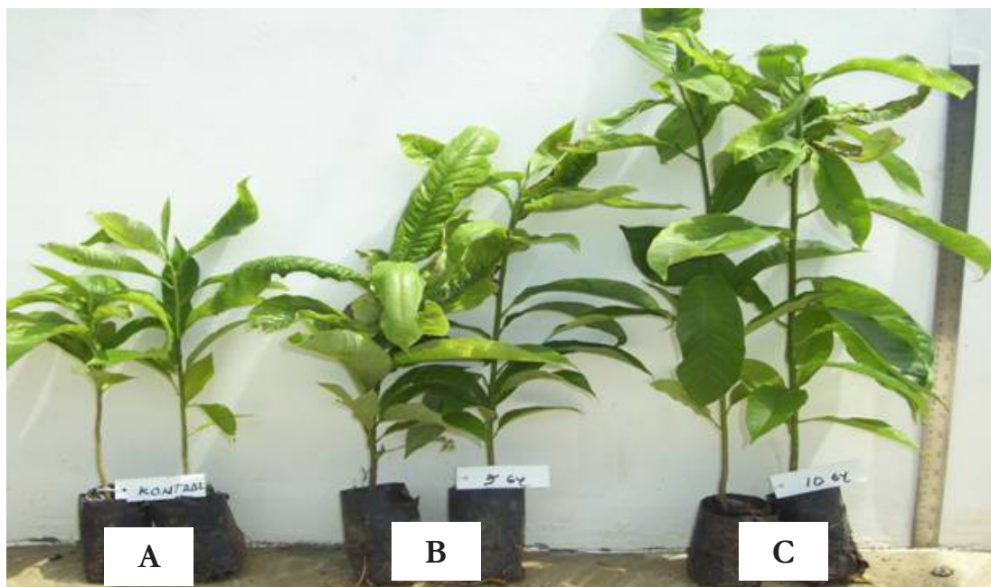
Figure 2. Performance of Magnolia champaca seedlings at 6 months age grown from irradiated seeds at doses 0 (A), 5 (B), and 10 Gy (C)

Remarks: The data shown are mean \pm standard error of six replicates; Different letters a, b, c, d and ab denote significant difference ( P \leq 0.05 ) between different treatments; ** = Significant at P < 0.01 ; * = Significant at P < 0.05