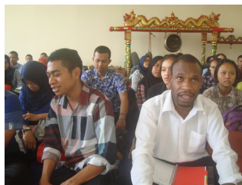
Figure 2. The Salendro Tone Learning Process in Sundanese Song Learning

Example in Figure 2 shows one of learning stage in the Gordon audiation in Major tonal, from Tonika to the Dominant. It shows varied interval movement that is started with rise and falling kwint interval, then is continued with rising and falling tert. The strengthening of tonal feeling in Gordon's learning stage entitled taxonomy of tonal patterns gives one a hearing sensitivity by singing various interval written in Figure 2.