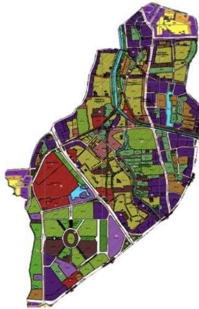
Figure 4. Zoning Maps in Tanah Abang Area

The Tanah Abang area is divided into at least seven dominant zones, namely the purple colored mark is a map of the distribution of Office and Trade areas, most of which are in the northern and eastern parts of the area. Marked in yellow is a distribution map of the Settlement area which is divided into sub-district equipment, luxury killers, and vertical killers which are dominant in the northern, western, and central areas. The signs in dark green and light green are a map of the distribution of park areas, green roads and green recreation in the center and south, especially in the GBK stadium area. The mark in red is a map of the distribution of government areas that are below the west of the area, namely the DPR/MPR RI government complex. Marks in brown are a map of the distribution of public service areas consisting of health, education, socio-culture, sports, public services and terminal facilities, spread in almost all areas of Tanah Abang. The mark in orange is a mixed area distribution map.