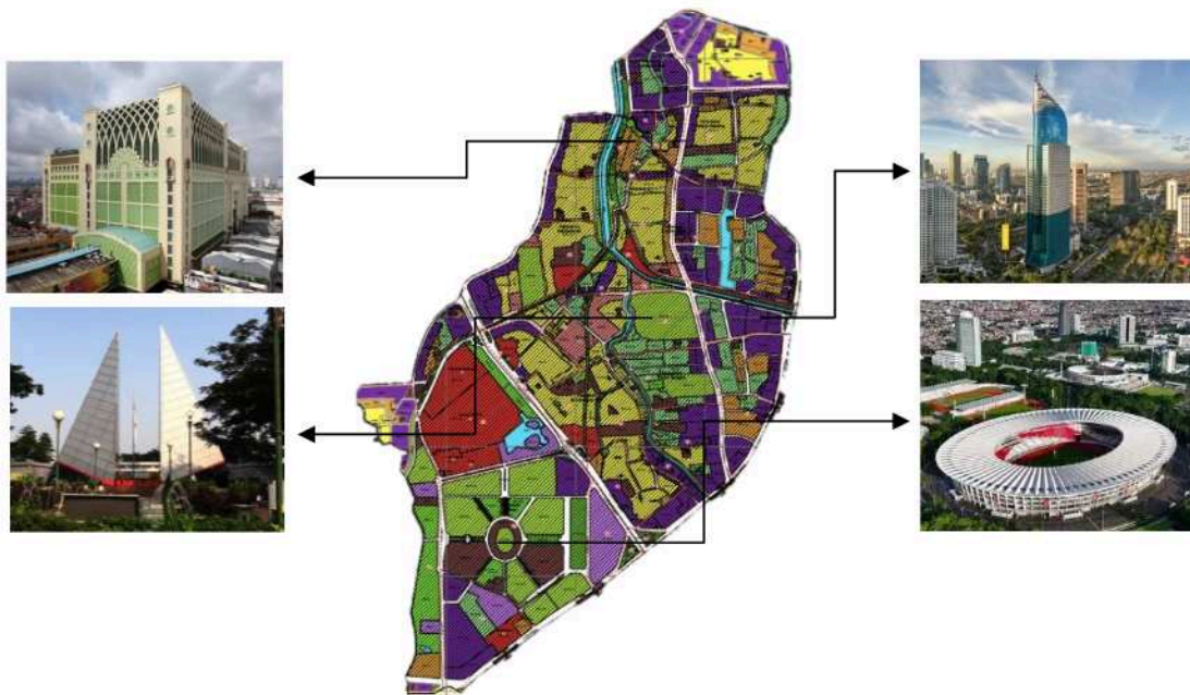
Figure 6. Landmark in Tanah Abang Area

According to Kevin Lynch, landmarks are important elements and are very simple to understand, because usually these elements are a symbol or a striking sign of an area, these symbols or signs can usually be assumed in the form of letters on buildings, statues, monuments, monuments, trees, including luxury buildings. The symbol or sign is tied to a meaning, which is produced by history, events, or the social and cultural meaning attached to the symbol or sign. Based on the results of a survey filling in the opinion polls of people who routinely carry out activities in the Tanah Abang area, researchers found at least four landmarks that were considered the most identical to the Tanah Abang.