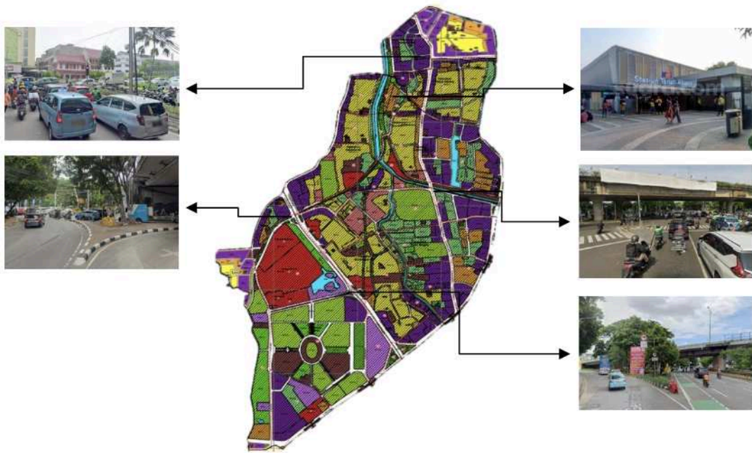
Figure 5. Main Meeting Point in Tanah Abang Area