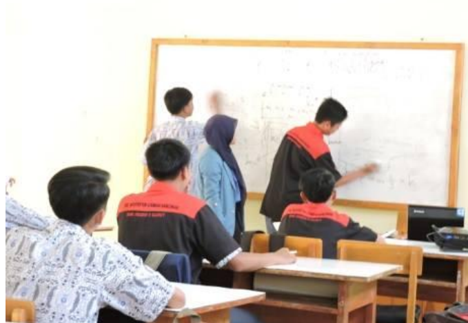
Figure 2. Application of Scaffolding model on the classroom.

Scaffolding learning outcomes learning model is superior to conventional learning models. Therefore, the implication to their motivation to learn by using scaffolding learning model is becoming superior to by conventional learning models.