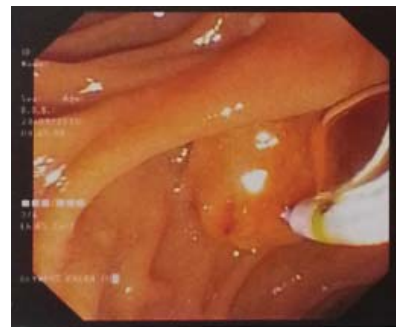
Figure 1. ERCP in patient showed a large stone in syctic duct

ERCP examination showed a dilatation of biliary duct (intra and extrahepatic) caused by large gallstone in cystic duct, suspect a Mirizzi's syndrome. This was suitable for the characteristic of Mirizzi's syndrome. ERCP has a higher sensitivity that CT Scan (42%) with 55-90% accuracy that can showed any malignancy in liver and hepatic portal vein. Even ERCP was known as diagnostic and therapeutic tools, a large and unusual location of stone that present in this case was hard to be extracted using ERCP. A moving stone location in this case was caused by spontaneous detachment of obstruction. 1,5