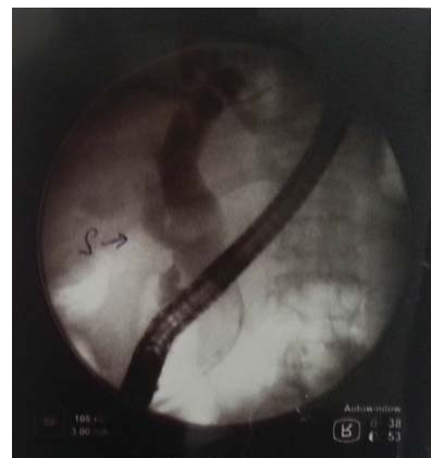
Figure 2. ERCP patients showed a radiopaque findings in cystic duct