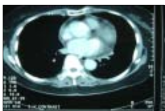
Figure 3. Diffuse circular thickness in the middle third of the esophagus

The next management of the patient was esophageal dilatation with Savary-Guillard dilatator 5 Fr to 14 Fr. Afterwards, the patient was planned to undergo esophagogastroduodenoscopy (EGD) biopsy and esophageal ultrasonography (EUS) guided biopsy or bronchoscopy with subcarinal fine-needle aspiration (FNA) biopsy.