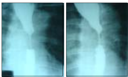
Figure 2. The narrowing of the middle third of the esophagus