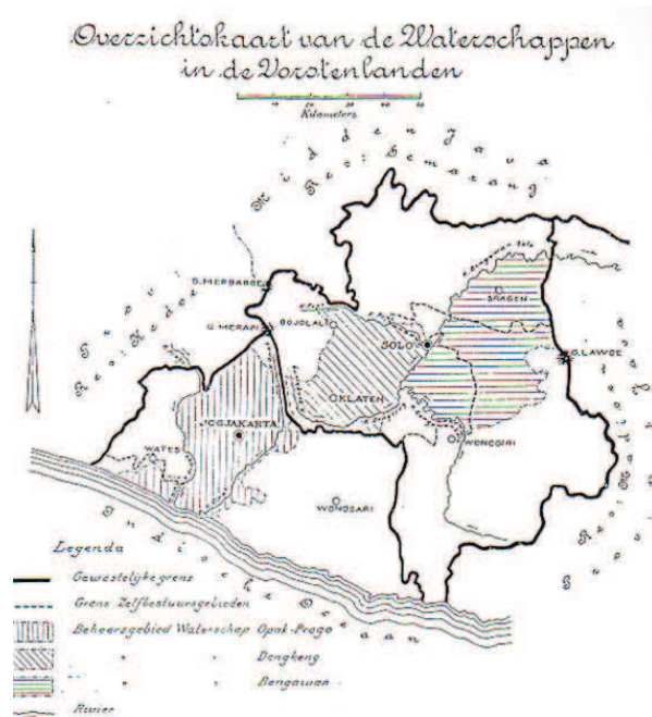
Figure 2 Operational areas of irrigation Institutions in Vorstenlanden

Scope of work area Waterschapp Bengawan measuring 68,000 bau , including the two onderneming . Coverage of exploitation in the north began bordering near the village of Pepe river in Nganti, the border river flow Cemoro up towards the Bengawan Solo. In the eastern part until the Sawur river tipped over Lawu mountain peaks. In the southern part of the border streams start Jlantah river until bridge near Tlobo village until to Jatipuro. At the Eastern start of Baboon river (area Jatipuro) Bengawan river, the Gandul river, the border area south of the river flow Nglumbi in Baderan, until the border Afdeeling of Klaten and Boyolali. In the west to the border of the western part of the Pepe river flow.