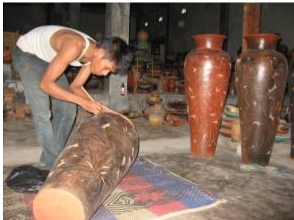
Figure 2. A young man painting pottery

up another job. Amongst the youth, the main problem is the increasing difficulty of obtaining work in the village. Previously, young men painted pottery and young women made pottery, but now they are no longer able to do these things. For some, especially young men, working outside the village has become one alternative means of overcoming this problem. The lack of employment opportunities has given rise to other social impacts, such as juvenile delinquency in addition to an explosion in drinking alcohol and small-scale theft.