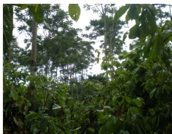
Figure 1. Agroforestry kayu bawang + coffee (left) and kayu bawang + cacao (right) smallholder plantations of kayu bawang in Bengkulu Province