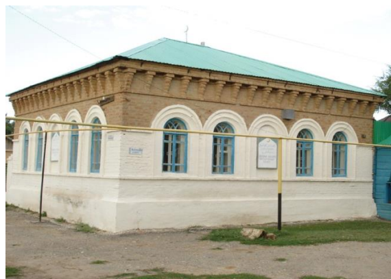
Figure 3 Mosque

1,500 exhibits are exhibited in 5 halls of the museum and the house-museum. It includes photographs, documents and weapons of V.I. Chapaev, information about the 25th Chapaev division, as well as graphic, pictorial and sculptural works depicting the famous division chief. The offices of V.I. Chapaev, the commissar of the division P.S. Baturin, and the working premises of the headquarters were restored in the house-museum. The cupboard, table, chairs, clocks, kerosene lamps placed here represent the daily workplace of the headquarters. At the same time, a cloak and a hat, an Underwood printing machine, a Morse machine, a genuine map marked by the staff for operational issues, teapots used by V.I. Chapaev are exhibited here [5, 15 p.].