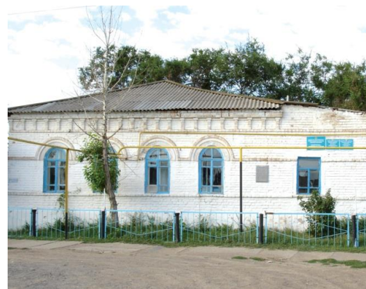
Figure 4 Hospital

The mosque, which is a holy place, built in 1853, is a historical and architectural monument of the 19th century.