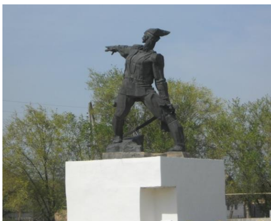
Figure 1 Monument to V. I. Chapaev