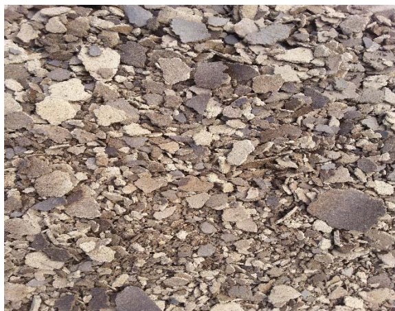
Figure 2. Drying process of Jatropha seed cake

The main fuel from the proposed system is Jatropha seed cake, primarily the Jatropha seed cake was collected from the oil mills. And dry it in to the atmospheric temperature or the dryer at the level of moisture content maintained as 5 %, 10 %, 15 % and 20 %.