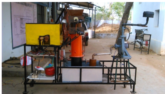
Figure 1. Fabricated and Erected 2 kW Gasifier