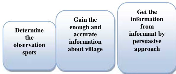
Figure 3.1: Procedures of the Research

The information gotten from the subdistrict would help get the informants for each subdistrict. Then, the researcher directly went to the village and looked for the informant. Persuasive approach ease the researcher to collect the information of the questionnaires arranged before.