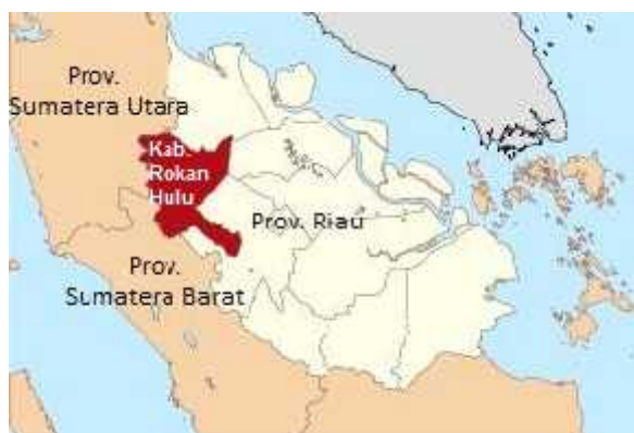
Figure 1.1: The Map of Rokan Hulu Regency, Riau Province Indonesia

In the resesarch of dialectology international/world scale, mapping the language is divided into two periods, before 1875 and after 1875. the making language mapping is conducted by Baron Claude Francois Etienne Dupin in 1814. While after 1875 period of the research of dialectology is known as two trends; German and French trend [1]. Whereas the development of dialectology in national scale—in Indonesia, is started by Ayatrohaedi under Language Centre of Indonesia. However, the project or research in Rokan Hulu Regency has not been done yet. Therefore, this research conducted in Rokan Hulu Regency-lies between North Sumatra Province with Bataknese/ Mandailing language and West Sumatra Province with Minangese language.