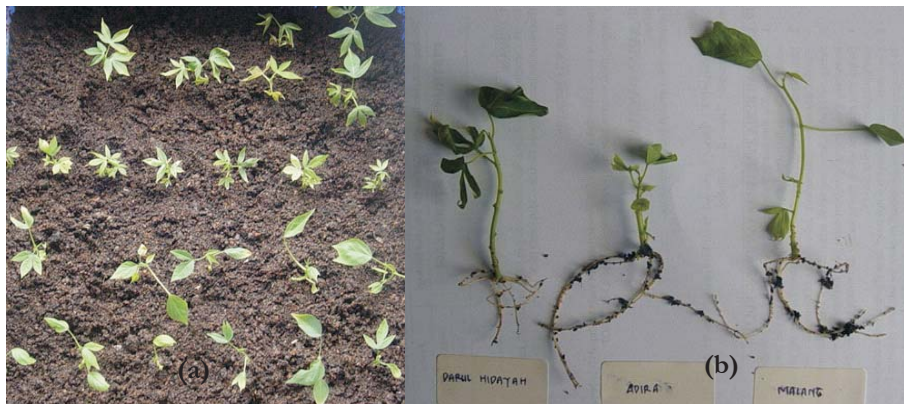
Fig.3. Seedlings in the green house after one week old acclimatization (a) and the performance of seedling roots (b).