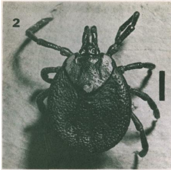
Figure 2. Amblyomma cyprium (adult female).

particularly murids (Kohls 1957; Kemp and Wilson 1979). Dermacentor (I.) steini (Figure 3) has recently been redescribed by Wassef and Hoogstraal (1986) who document a wide distribution for this species in Indo-Malaysia (including the Philippines and with establishment on Papua New Guinea); however, they give no records for Sulawesi so the present collections extend the documented range for this tick.