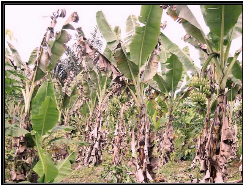
Figure 4: Disease severity of Black Sigatoka on banana in North Sumatra