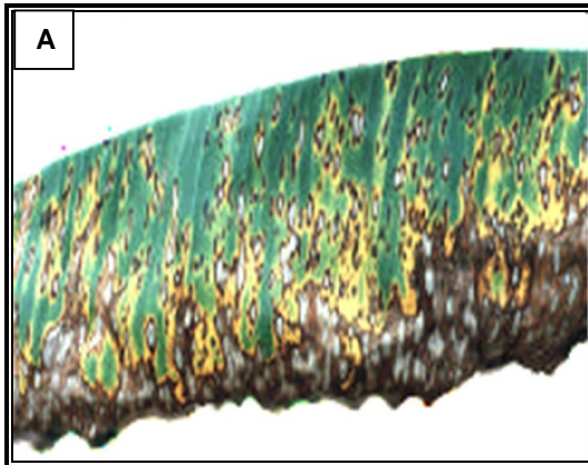
Figure 1A. Symptom of Black Sigatoka.

The first symptom of Speckle leaf disease is the occurrence of small spots with the size of