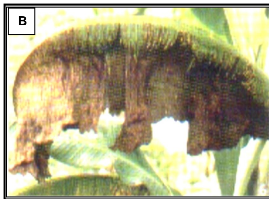
Figure 2 B. Advanced symptoms of Eumusae leaf spot