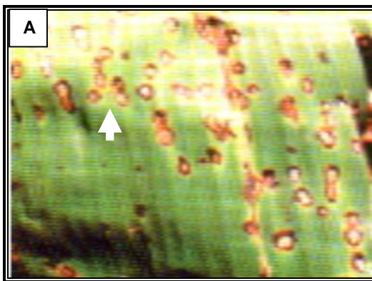
Figure 2A. Early symptom of Eumusae leaf spot (arrow).