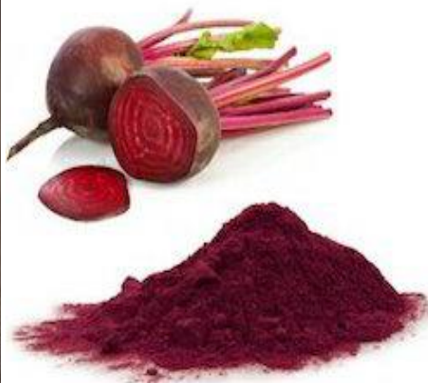
Beet Root Powder