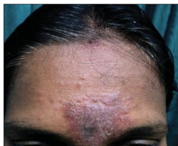
Figure 3: Bindi leukoderma Figure 4: Allergic contact dermatitis to sticker bindi