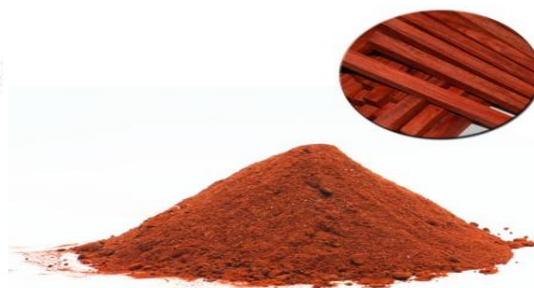
Pterocarpus Santalinus Powder