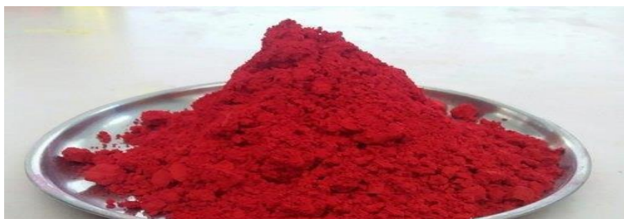
Figure 6: Prepared Herbal Kumkum

Procedure: The crude drug was finely powdered by using grinder and passes them by fine mesh sieve. The powdered form of drug was then mixed and thick slurry was made by mixing the water in it. Blending of slurry was done by using stirrer to obtain a liquid colored paste. If water was remained in slurry, therefore, it was filtered and evaporated till dry powder of paste was obtained. Powder obtained was then pulverized to fine powder to get herbal Kumkum.