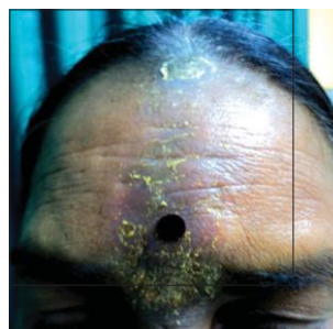
Figure 1: Kumkum-induced pigmented contact dermatitis Figure 2: Allergic contact dermatitis

Nath and Thappa found pigmented contact dermatitis [Figure 1] in 76% of the patients and allergic contact dermatitis in 24% of the patients using kumkum. The most common site was forehead, followed by the glabellar area, hair parting, abdomen, and neck [Figure 2]. The surrounding skin may be involved if the kumkum trickles down the skin in sweat. Other presentations include only brown or slate gray hyperpigmentation without clinically overt dermatitis (Osmundsen P. E., 2010) and lichen planus pigmentosus (Kumar AS et al. 1986). The terms kumkum and bindi overlap somewhat, but are not synonymous. Kumkum is always applied with paste or powder and can cover the face or other parts of the body. On the other hand, a bindi may be paste or a sticker and is worn only between the eyes. Self-adhesive bindis (sticker bindis) are disposable