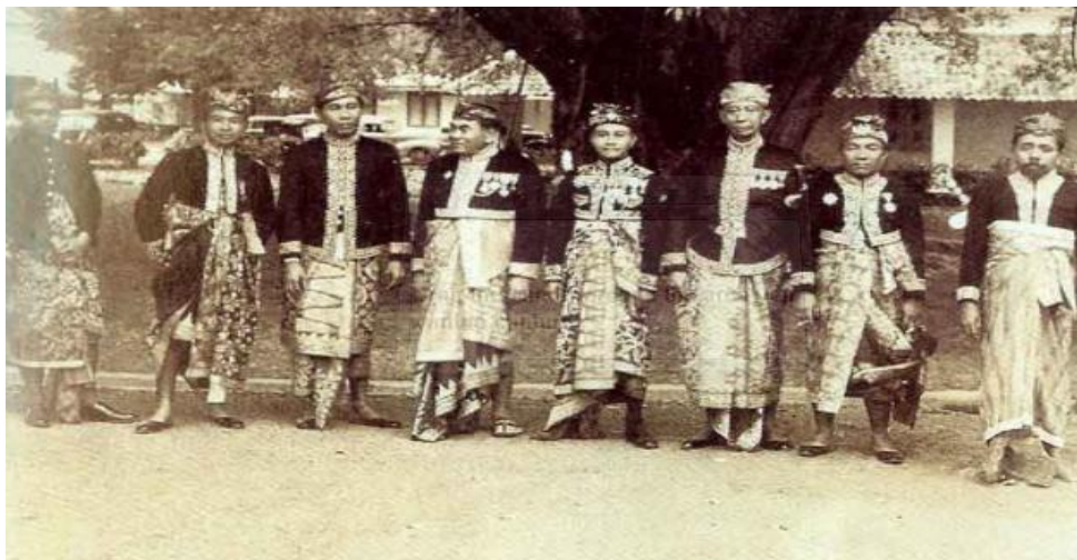
Figure 1. The eight of Balinese Kings in 1938, in front of the Resident's Houses of Bali-Lombok