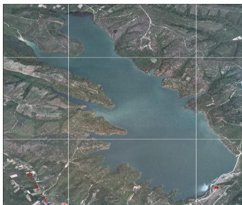
Figure 1. Satellite view of the Radoniqi Lake

The Radoniqi Lake is built to collect drinking water near the Gjakova region in western of Kosovo. The lake is placed on a surface approximately 580 hectares and has a length of about 5 km and with a width 2 km. The altitude is from 402 to 456.4 m. The amount of accumulated water is estimated approximately 117 \times 10^6 \text{ m}^3 and with a maximum depth of 52 m.