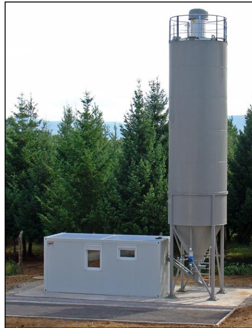
Figure 3. Equipment the activated carbon dosage