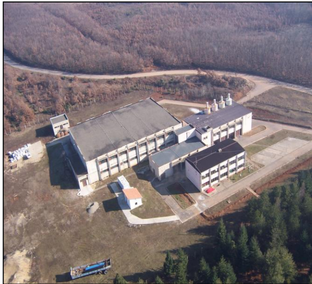
Figure 2. Filtration station

In the Radoniq lake water are dissolved and it contains different materials, which affect drinking water quality. All these materials can be separated into physical, chemical and microbiological.