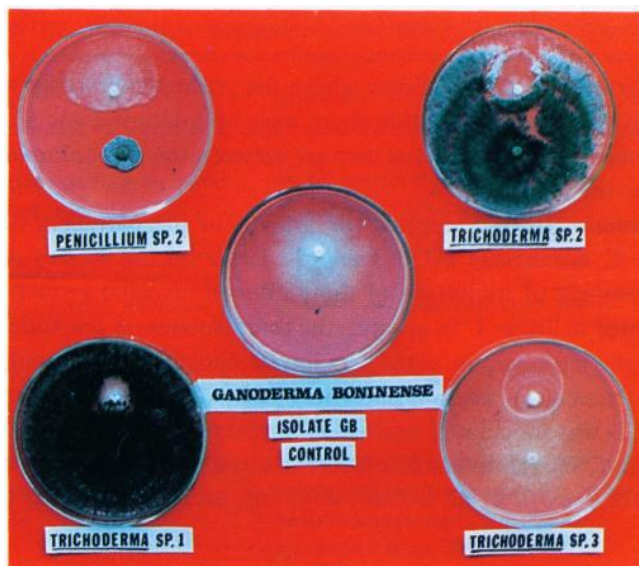
Figure 3. Antagonism between Ganoderma boninense isolate GB and Penicillium sp. 2, Trichoderma sp. 1, Trichoderma sp. 2 and Trichoderma sp. 3.

Cook and Baker (1983) stated that Penicillium and Trichoderma have long been recognized as antagonists to plant pathogenic fungi. All of the ten isolates obtained were further tested on the possibility of inhibiting the growth of the pathogen (isolate GB) in vitro using the direct opposition method as recommended by Dennis & Webster (1971). Of the 10 isolates, only four showed promising result, that is Penicillium sp. 2, Trichoderma sp. 1, Trichoderma sp. 2, and Trichoderma sp. 3 (Figure 3).